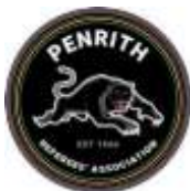
Gary Haines Chair