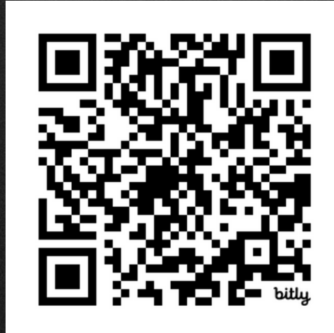
OR VISIT bit.ly/JnrRepPreso24