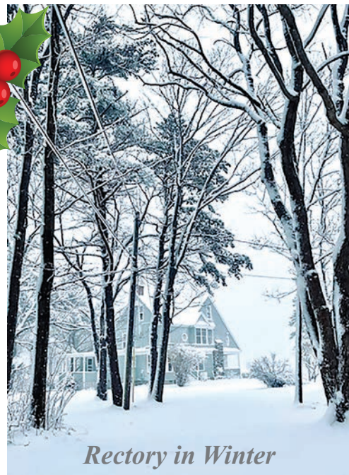
Rectory in Winter