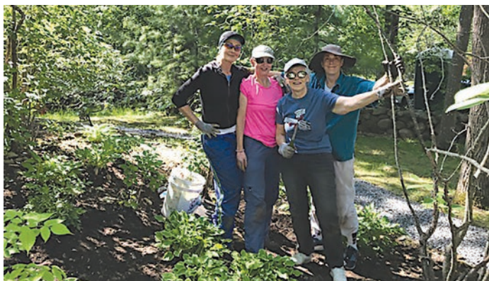
The gardeners who help keep our grounds beautiful!