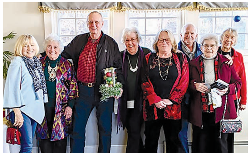
Those from St. Peter's who stayed during the cold winters of Maine gathered for a Christmas luncheon at the Beachmere in Ogunquit in December!