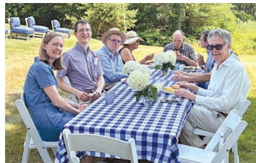
July 14, 2024 Annual Guild Picnic