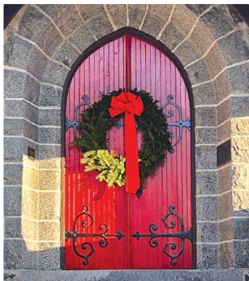
St. Peter's By The Sea Episcopal Church is ready for Christmas!