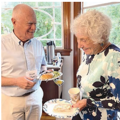
June 9, 2024 Welcome Fest