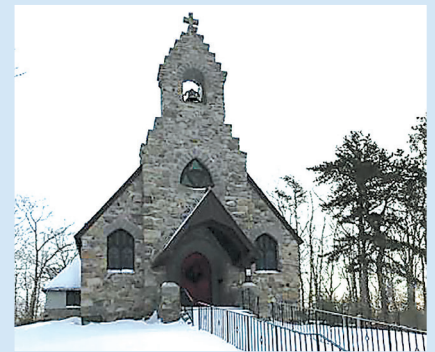
St. Peter's by the Sea Over the Years

Top to bottom: 1903; 1934; Year unknown with church attendance overflow in the lawn; Water tower in February 1967; Winter scene in January 2019.