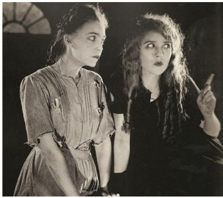
Figure 2. Mary Pickford (right) and ZaSu Pitts (left) in <a href="The Little Princess">The Little Princess</a> (1917)

Whitfield notes that Pickford, in addition to being a talented actress, was a savvy business woman with great "financial acumen" (3). She delivered what her audience wanted to see, successfully tapping into "popular filmgoing taste for two decades" (Whitfield 3). Whitfield contends that Pickford was very aware of the Victorian (Romantic) sensibility of her public with regard to the sentimentalization of childhood and images of children (153). According to Higonnet, popular images of Romantic childhood include five themes that "artists of all abilities" use: child as miniature adult; child as angel or cupid; child with pet; and dress-up fun (Higonnet 36). Pickford, who had a great deal of artistic control in her pictures, used many of these elements in her version of ALP: Sara is alternately elegantly and nostalgically costumed (Rich Sara has Art Deco frocks and a Poor Sara has Cinderella-like dresses); she is surrounded by animals (dogs, ponies, and Ram Dass's monkey); large-scale furniture is used in this, as in other Pickford films, to make her seem even smaller (Whitfield 154). Indeed Whitfield writes that in her soft-focused, demurely-attired publicity still she is "often posed with kittens, puppies, or a birdcage" (153). If Pickford's Sara was quintessentially Romantic and normative, what of ZaSu Pitts as Becky?