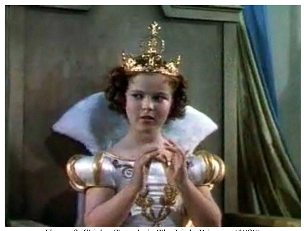
Figure 3. Shirley Temple in <u>The Little Princess</u> (1939) Image in the public domain Available though Wikimedia Commons http://commons.wikimedia.org/wiki/File:Shirley_Temple_in_The_Little_Princess.jpg

Miss Minchin's ex-vaudevillian brother, Bertie); song-and-dance numbers are added; a love-story sub-plot is tacked-on; Queen Victoria makes an appearance; the military action is switched from India to South Africa; and in the film's finale Captain Crewe, discovered to be wounded, not dead, is ultimately reunited with Sara. With regard to the characterization of Sara however, I would argue that the films are remarkably and purposefully the same. Pickford, a generation earlier had established a successful formula for images of childhood in films. She created an archetype of American girlhood that audiences clamored to see. By 1939, Temple's career had begun to sputter. America's Little Princess was approaching adolescence; she was getting taller, her voice was deepening, and her golden curls were turning brown. Producer Daryl Zanuk turned to big-budget classics like <u>ALP</u> to rekindle the Temple magic (Windeler 203). While <u>ALP</u> was critically acclaimed for its production values and for Temple's film portrayal, it was out-performed at the box office by MGM's <u>The Wizard of Oz</u> starring Judy Garland.