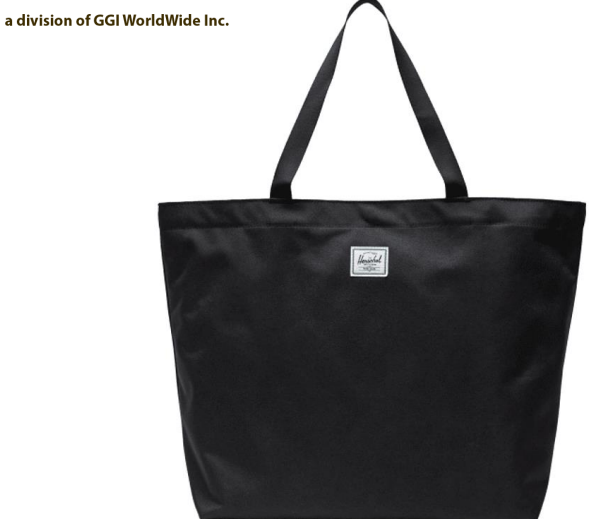
2009-66 Herschel Recycled Classic Tote MSRP - $40.00