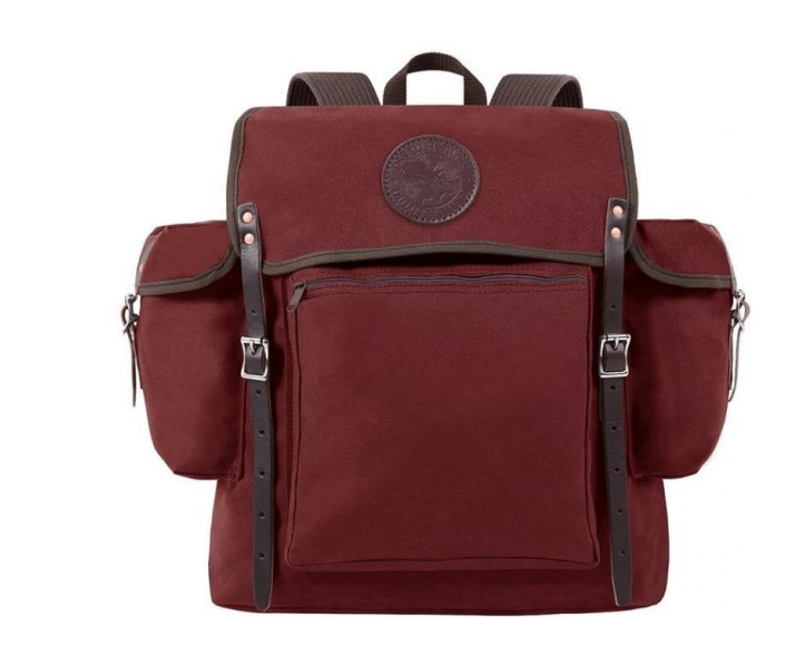
SELECT ONE: BURGUNDY