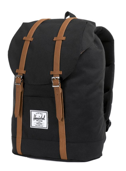
2009-02 Herschel Retreat 15" Computer Backpack MSRP - $110.00