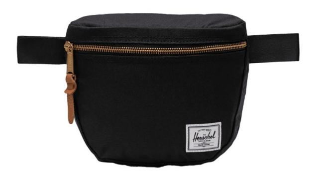
2009-47 Herschel Recycled Settlement Hip Pack MSRP - $40.00

Note: Pricing & availability are subject to change depending upon when orders are received. All gifting events will require 50% down when placing order.