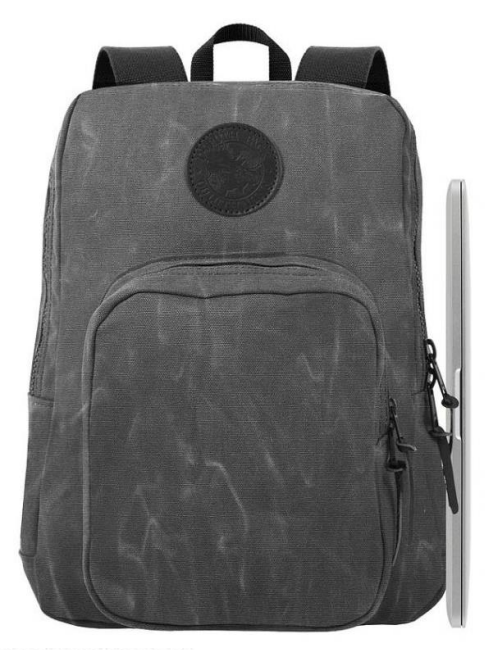
SELECT ONE: WAXED GREY