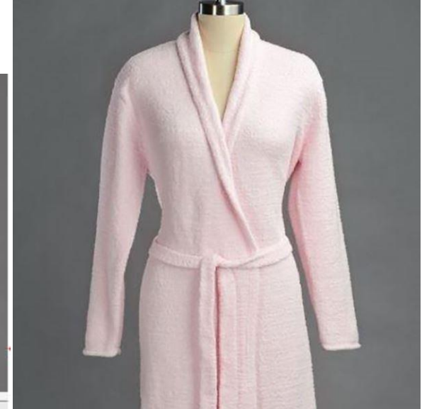
R-04 - Womens Seasonless Long Robe