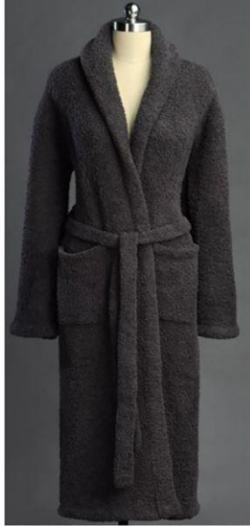
R-01 - Shawl Collar Robe