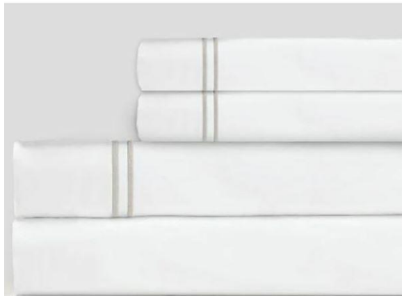
77320-QN Grande Hotel Collection Queen Sheet Set Retail : $431.00