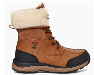
Women's Adirondack Boot III #1095141 Retail - $250.00 Sizes - 6-10