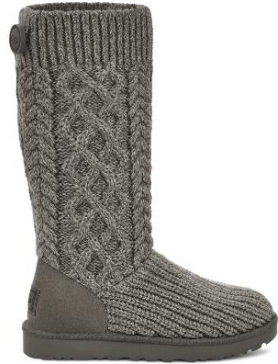
Women's Classic Cardi Cable Knit #1146010 Retail - $160.00 Sizes - 5-10