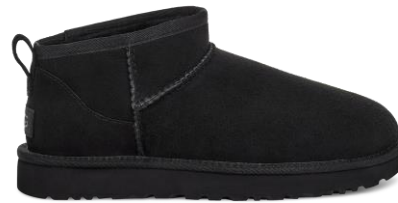
Women's Classic Ultra Mini #1116109 Retail - $140.00 Sizes - 6-10