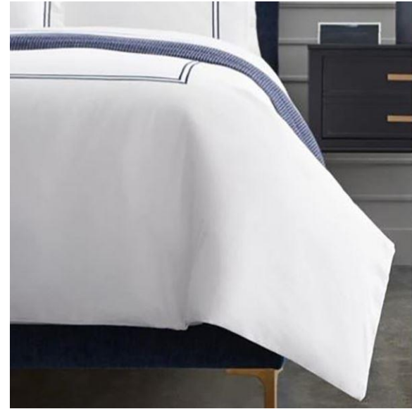
77320DUVKG Grande Hotel Duvet Cover King Retail : $303.00

Note: Pricing & availability are subject to change depending upon when orders are received. All gifting events will require 50% down when placing order.