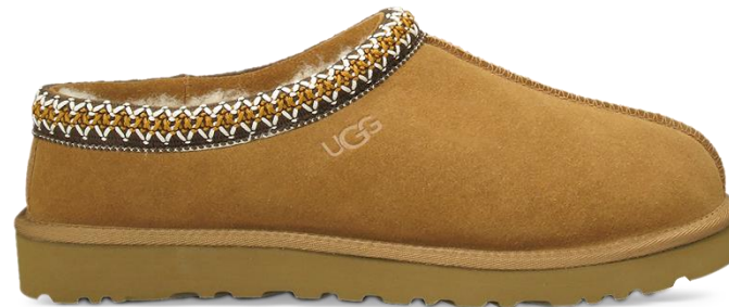
Men's Tasman 5950 - Chestnut Retail - $110.00 Sizes - 8-14