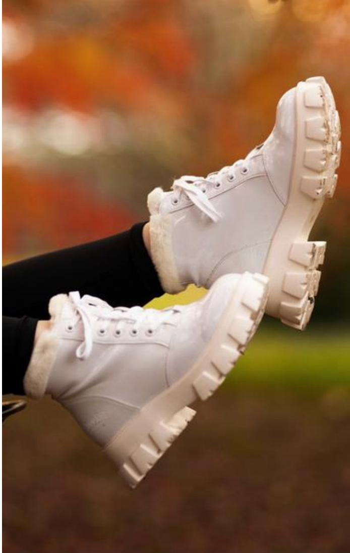
LADIES SHEEPSKIN MOCCASINS 2 CNS-101-2 CHESTNUT SIZE 8