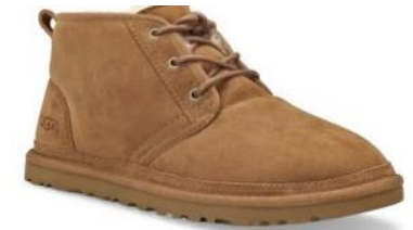
Men's Neumel – Chestnut #1121645 Retail - $140.00 Sizes - 8-12