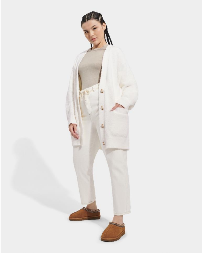
Women's Joselyn Cardigan II 1153775 - Cream Retail - $138.00 Sizes - XS - XL