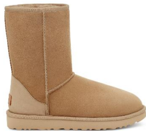
Women's Classic Short #1016223 Retail - $180.00 Sizes – 5-11