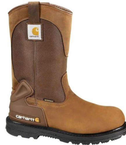
CMP1100 - Mens 11" Wellington Boot MSRP - $189.99

Note: Pricing & availability are subject to change depending upon when orders are received. All gifting events will require 50% down when placing order.