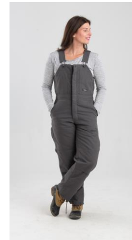
Women's Softstone Duck Insulated Bib Overall WB515 MSRP - $114.40

Note: Pricing & availability are subject to change depending upon when orders are received. All gifting events will require 50% down when placing order.