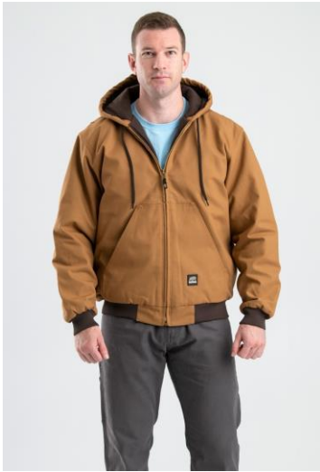
Heritage Duck Hooded Active Jacket HJ51 MSRP $97.76