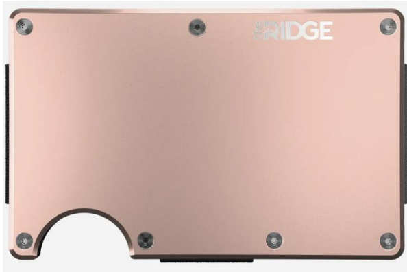
252 - Ridge Wallet - Rose Gold with Money Clip MSRP - $95.00