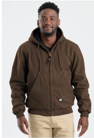
Heartland Washed Duck Hooded Jacket HJ375 MSRP - $110.24