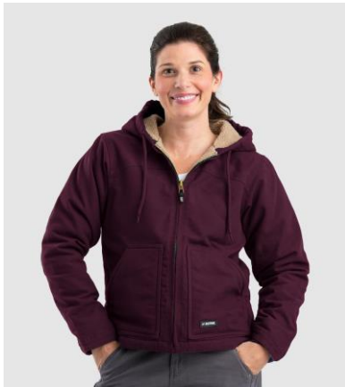
Women's Sherpa-Lined Softstone Duck Hooded Jacket WHJ43 MSRP - $102.44