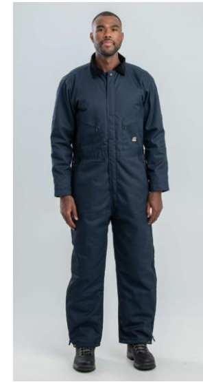
Heritage Twill Insulated Coverall I414 MSRP - $150.54