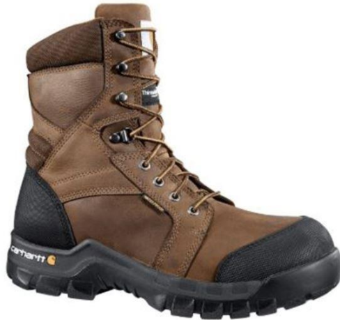
CMF8389 - Mens 8" Insulated Work Boot Composite Toe MSRP - $189.99