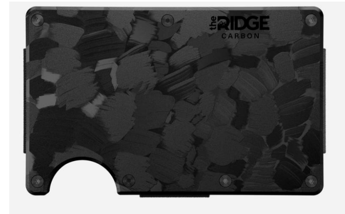
K233 - Ridge Wallet - Forged Carbon with Cash Strap MSRP - $140.00

Note: Pricing & availability are subject to change depending upon when orders are received. All gifting events will require 50% down when placing order.