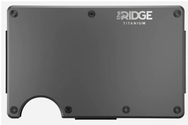
322 - Ridge Wallet - Matte Gunmetal Titanium with Money Clip MSRP - $110.00