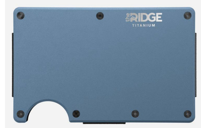
314 - Ridge Wallet - Cobalt Titanium with Money Clip MSRP - $110.00