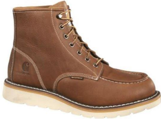
CMW6175 - Mens Soft Toe Wedge Boot MSRP – 169.99