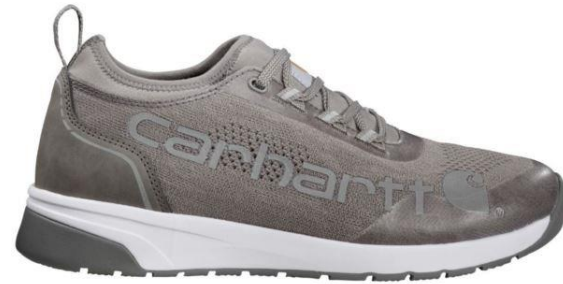
FA3002-M - Mens Force 3" Non-Safety Toe Work Shoe MSRP – 124.00