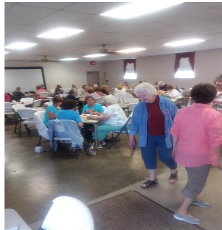
Card Party October 23 rd - Come join the fun!

Remind – Would you like to be notified of upcoming events via text? The church has set up the Remind App for text updates (the same app that is used in many schools). To sign up, please text @schoenbru to the number 81010