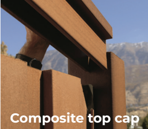
Composite top cap