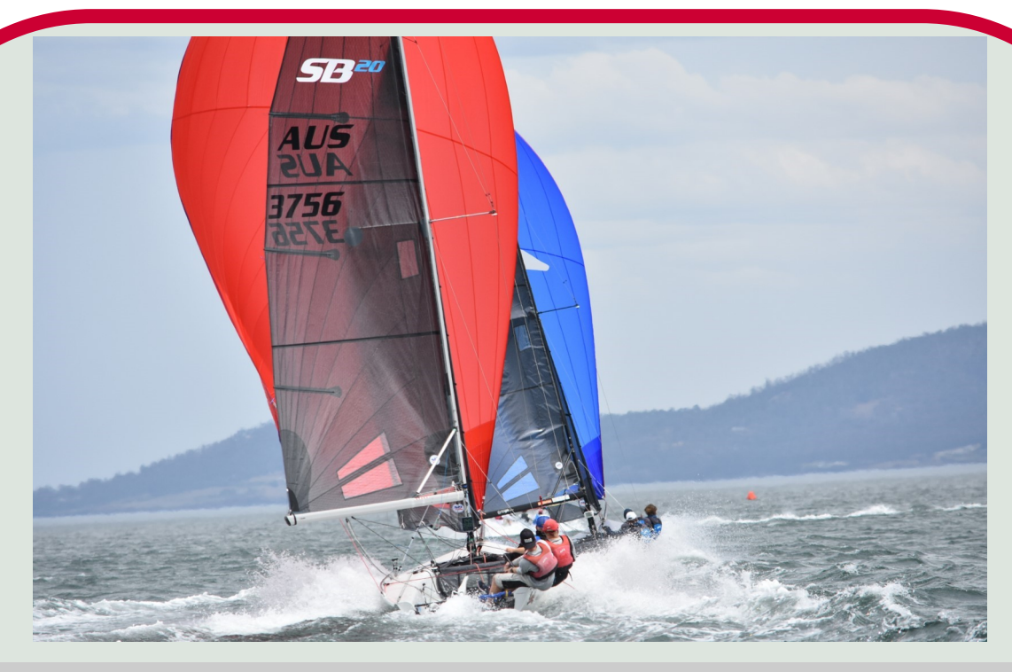
The SB20 Regatta on Spring Bay over the March Long Weekend—what an event!!