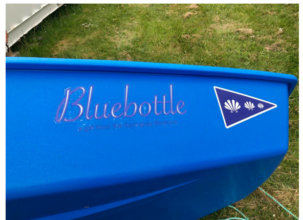
The SBBC sponsored “Bluebottle”