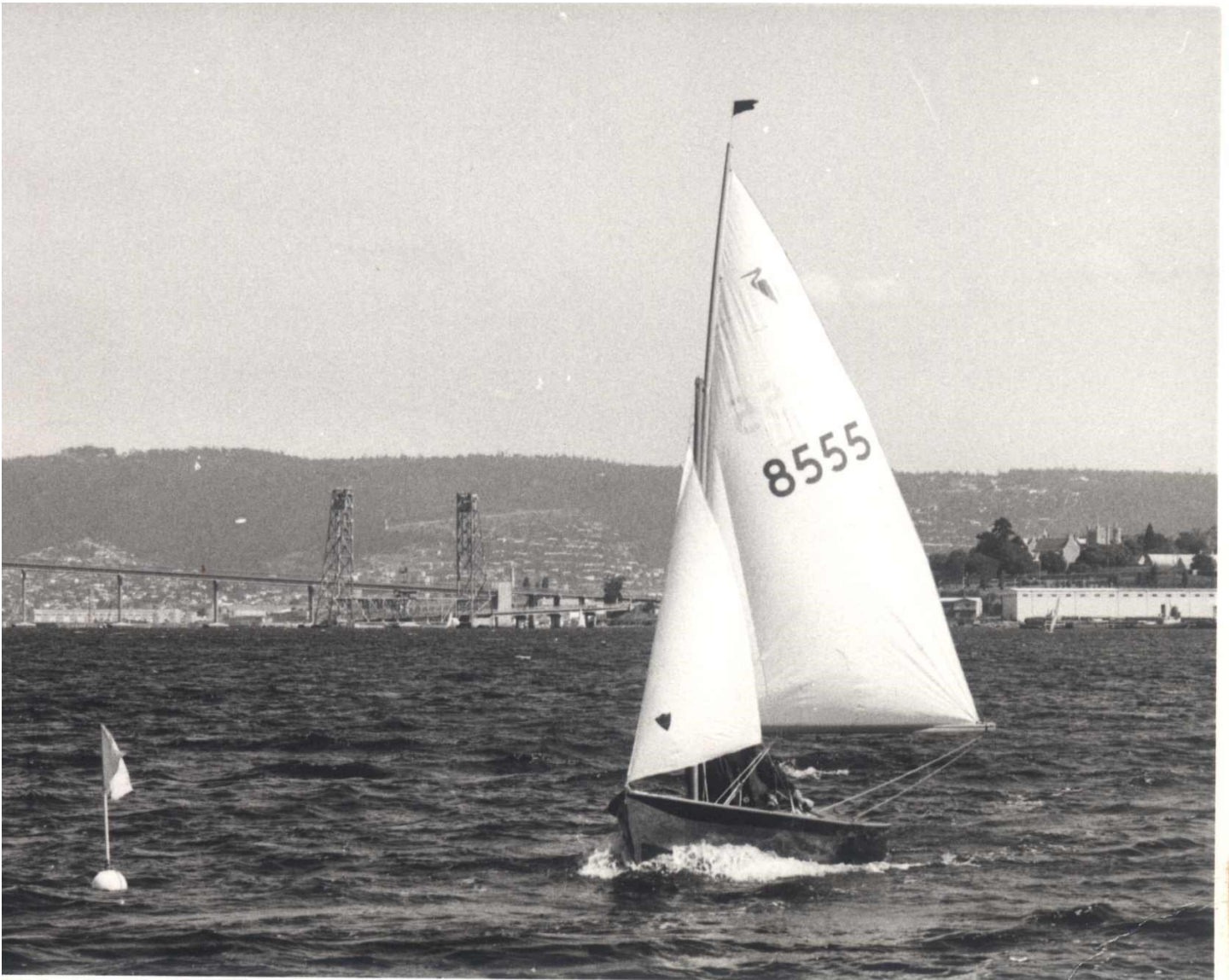
Wiwirri sailing out of Lisdisfarne Sailing Club in the 1970s. Note the old pontoon bridge lifting span in the background.