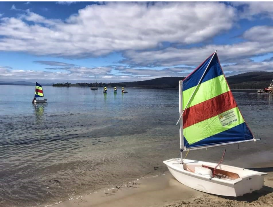
Some of the Port Esperance Sailing Club's new Optimist dinghies. (Our blue one is out there somewhere.)

We wish their club all the best in their continued efforts to re-build and provide a maritime and social hub for their community. The outlook is definitely optimistic!