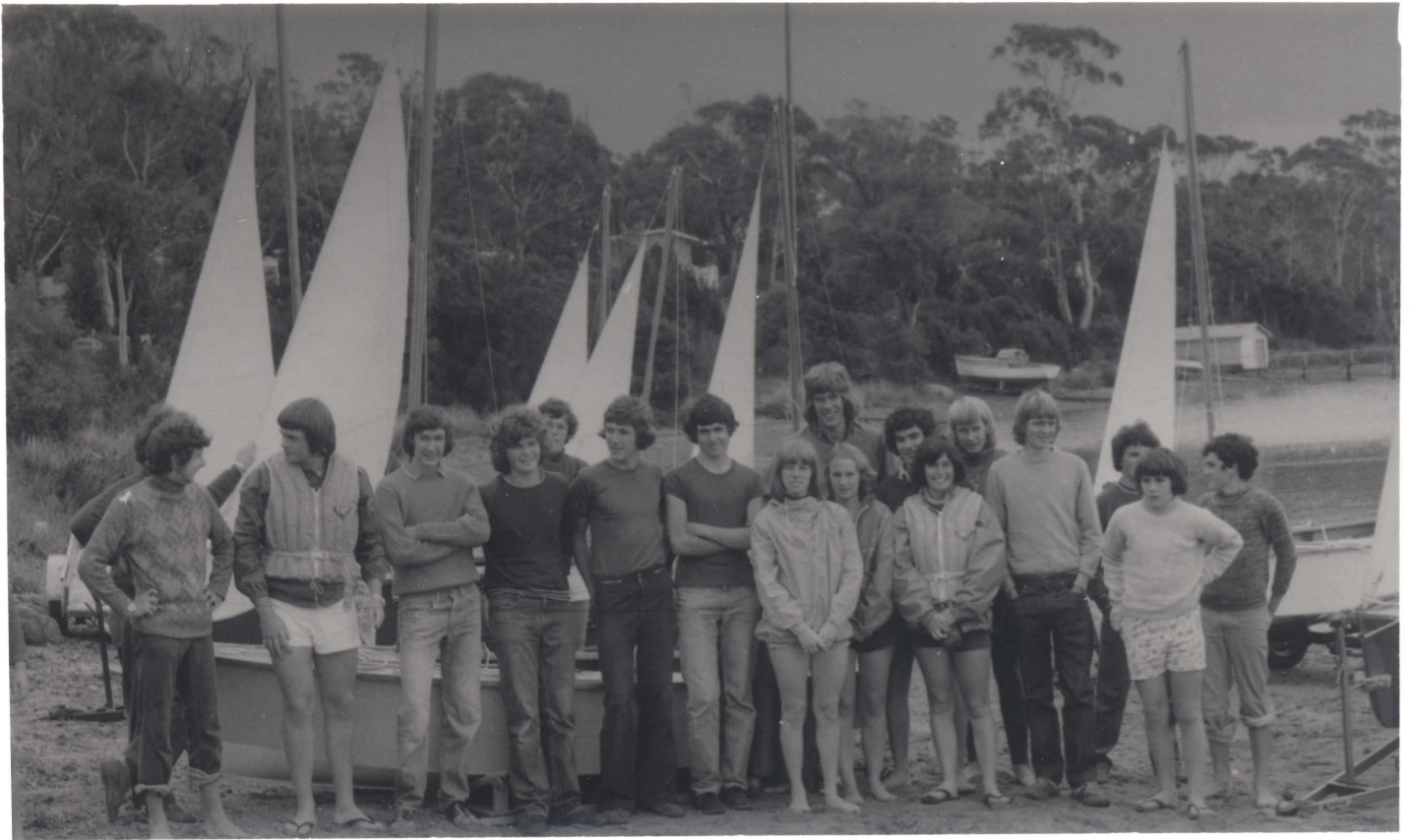
Heron sailors at One Tree Point prepare for an invitation race prior to the Tasmanian State Championships in 1979.