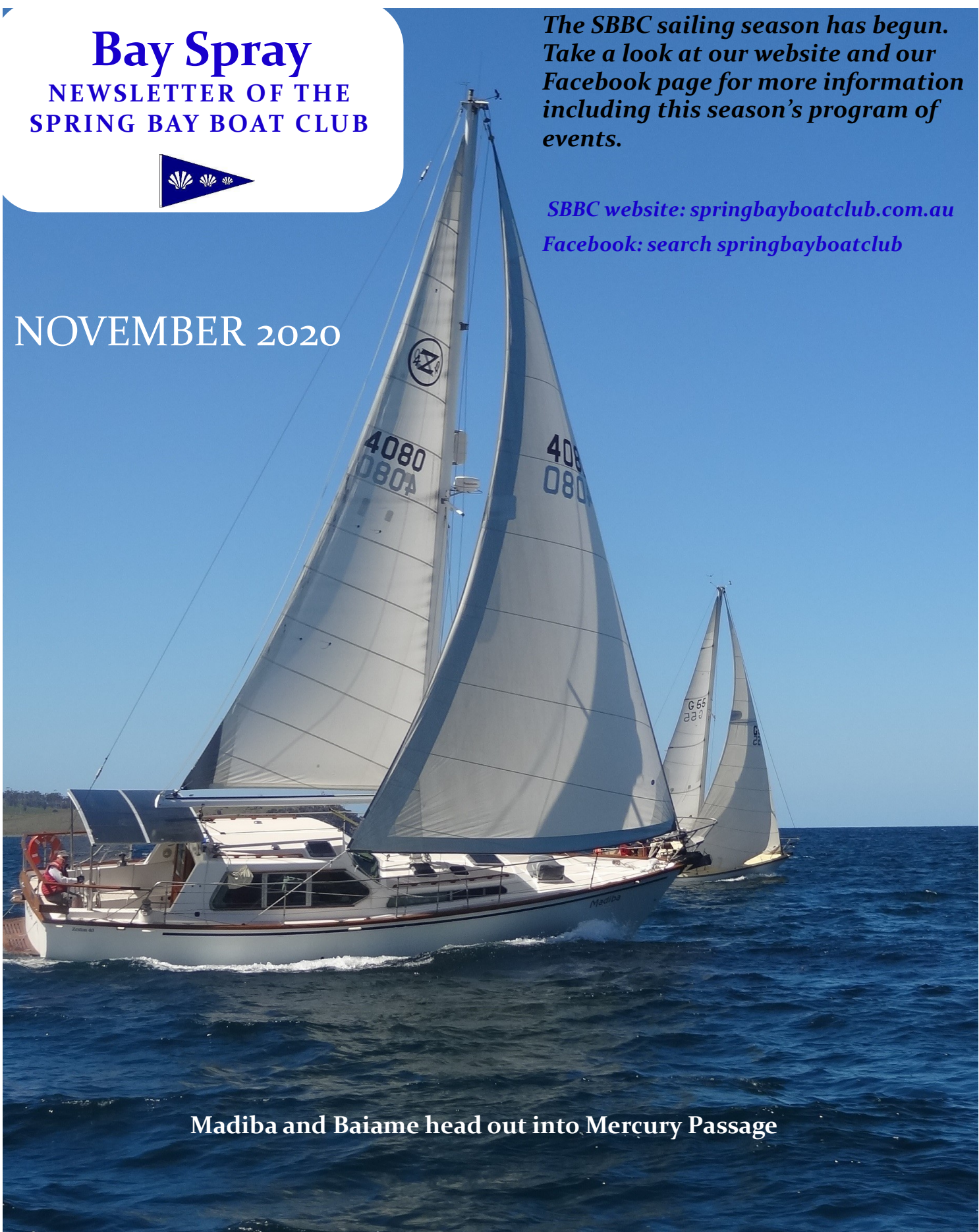
Madiba and Baiame head out into Mercury Passage