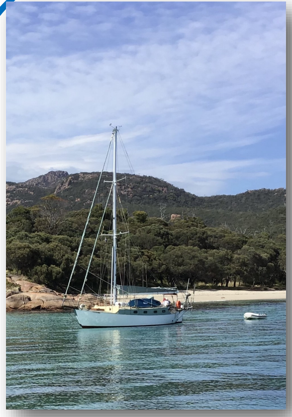
ABOVE and RIGHT: Deseado and Madiba looking placid in the calm waters of Crockett's Bay (Gravelly Beach) at Schouten Island on this year's East Coast Classic.