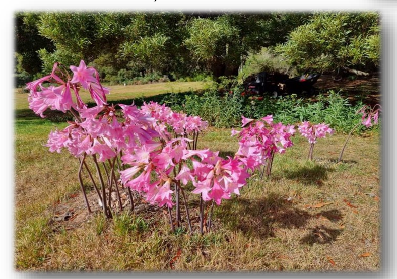
Some of the many Naked Ladies at our camping spot on Bruny Island. Plenty of time was also spent at the beach in front of the cottage, lazing, swimming, boarding etc. where (rumour has it) at least one of the other kind was spotted. But this was during a very early morning paddle by one of our members who might have been still in dreamland at the time!