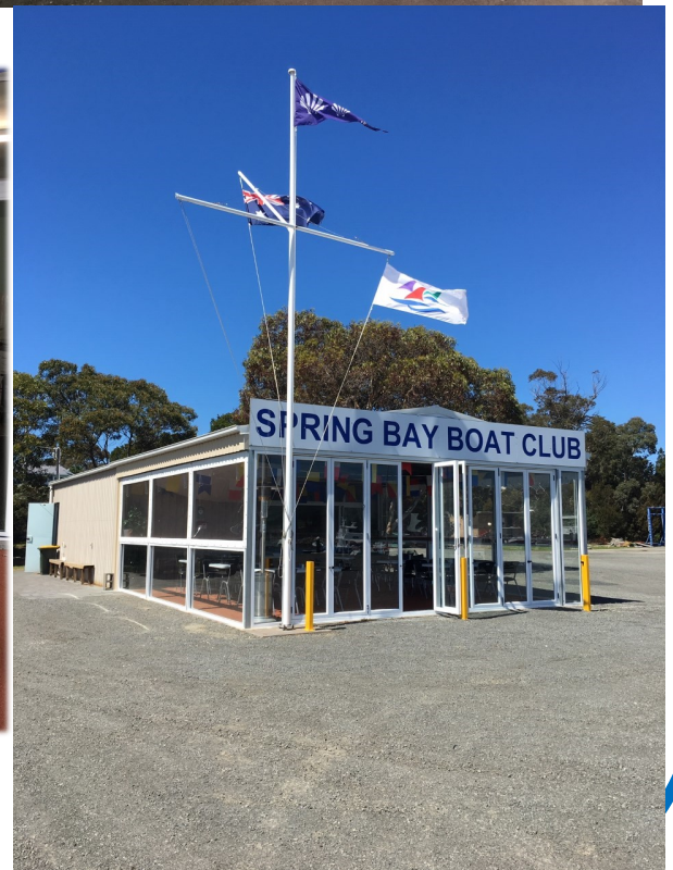
Above & Right: creating an integrated space. Our West Wing and East Wing combine!