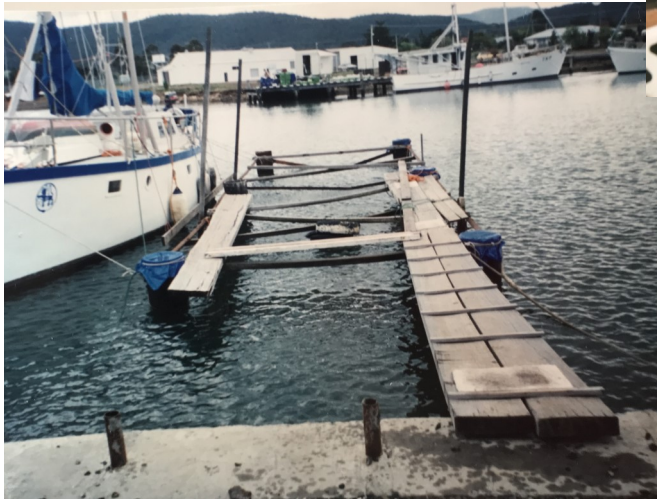
The beginnings of the first Marina (above) and the original Clubhouse (above right and right) which we still use but which has been extended and enhanced. Note that an unlined tin shed is exactly what it was at first.