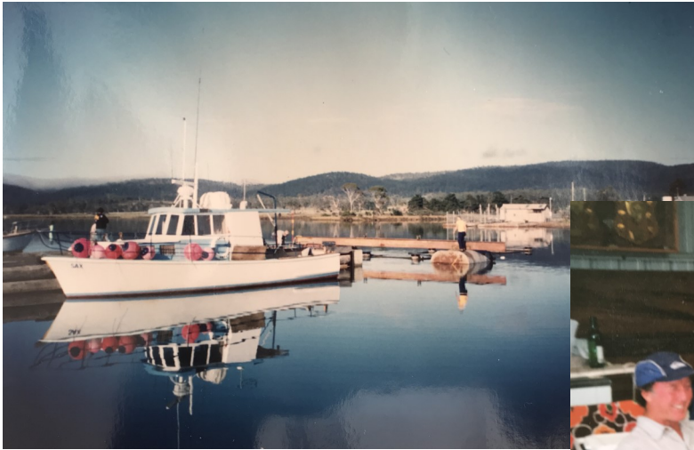
The land was “created” and SBBC took out a lease.