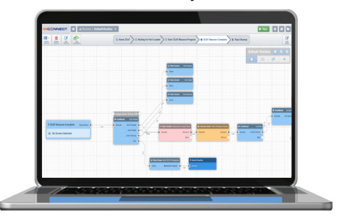
MiConnect Project Flow Chart