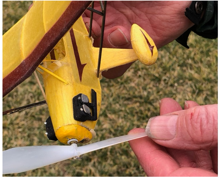
Bruce Foster Showed up with this Cutie, Get a load of the engine