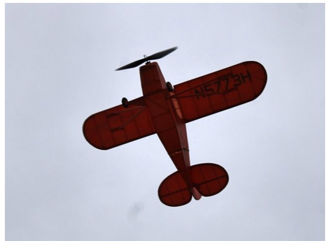
Gibbs, The launch and a great overhead view