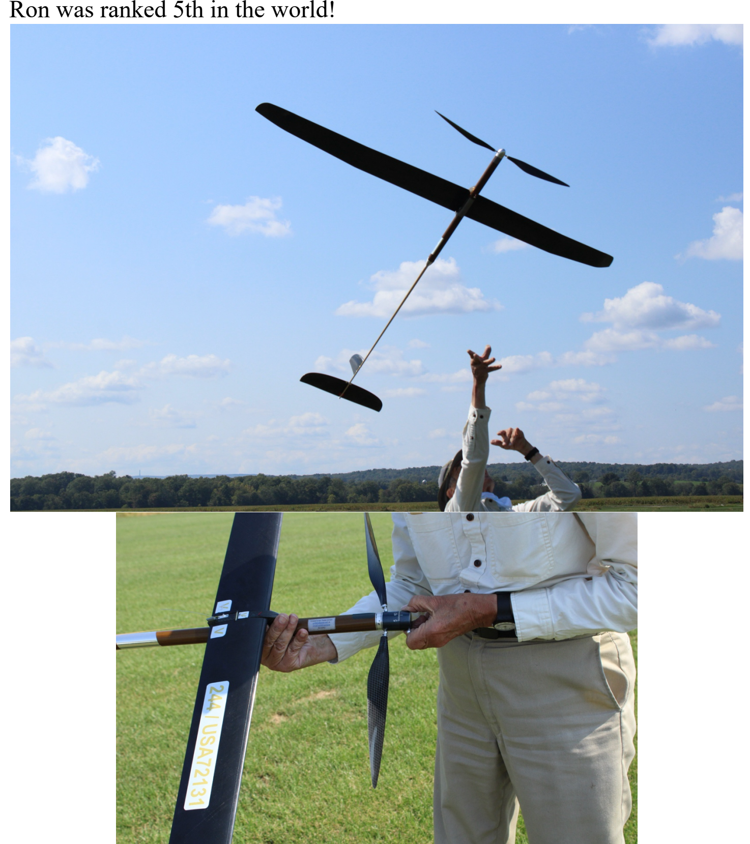
The Torque meter I mentioned

flying well and all the clean-up when you buy one. Not exactly a ready to fly model. And the best part was finding out as of September 15 2024, Ron was ranked 5th in the world!