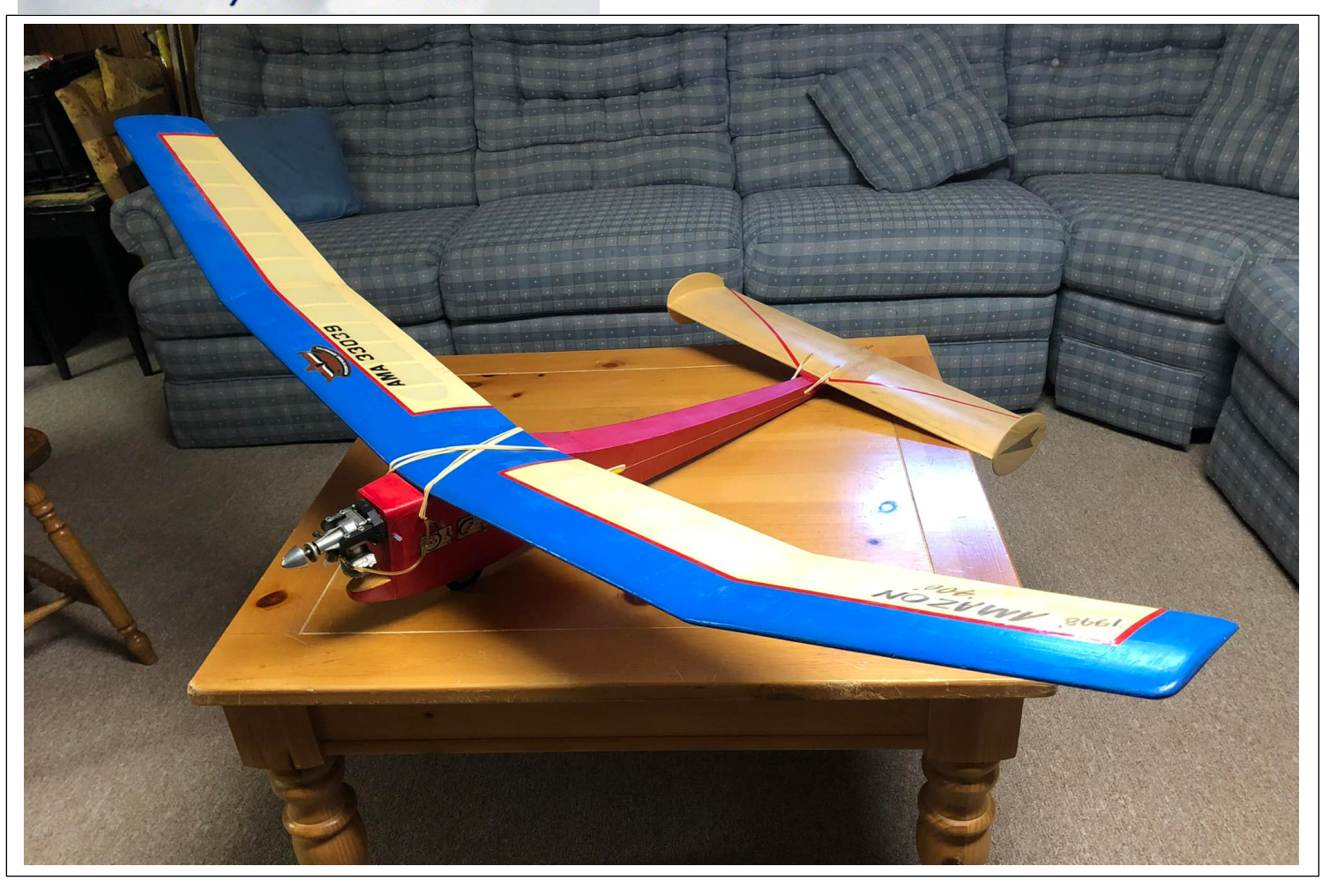
One of Jim's Power models. Back in the day I have seen this one fly. Went like stink on rails!