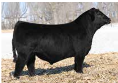
OMF JOURNEYMAN J24 $110,000 Sire of Lot 100A