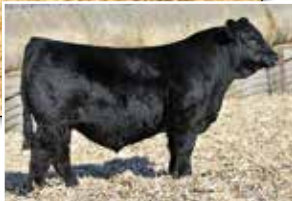
WINC NEXT GENERATION 0111H Sire of Lots 51-56