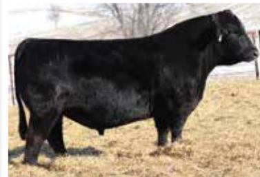
RUBYS TURNPIKE 771E Paternal Grand sire of Lots 1-10