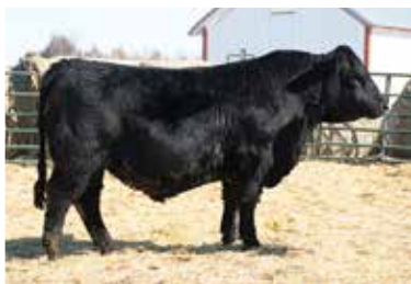
WCS MAINSTAY 1536J Maternal Brother to Lot 12