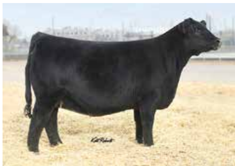
WCS MS COBRA 1018J Full Sister to Lot 70