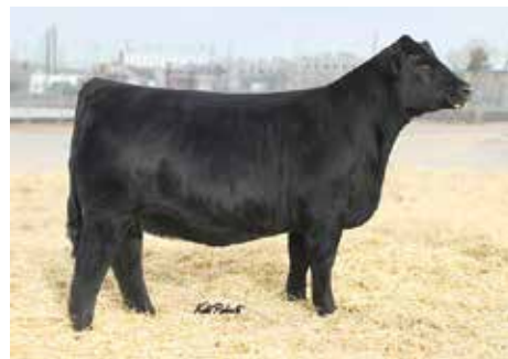
WCS MS SHELBY 1806J Full Sister to Lot 70