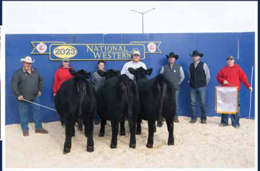
2023 Res. Grand Champion Pen of Three Purebred Females