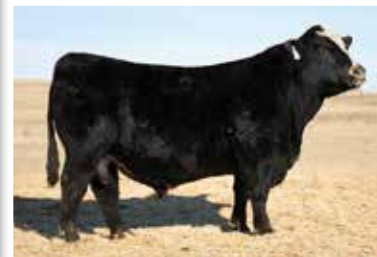
FELT TAKE CHARGE 101H Sire of Lot 77