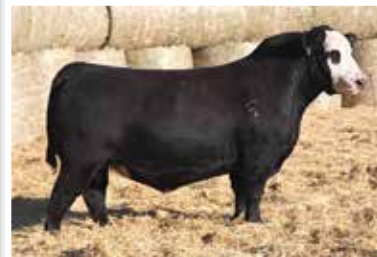
MR W/C TRIFECTA 975J Sire of Lots 33 & 34