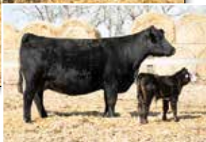
LRS MS ELEVATE 6019D Dam of Lot 52 & Maternal Granddam of Lot 53