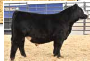
WCS MR STAY 2121K Maternal Brother to Lot 54