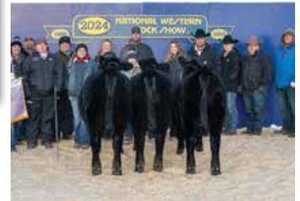
2024 NWSS RESERVE GRAND CHAMPION PEN OF THREE PB SIMMENTAL HEIFERS Daughters of 6019D