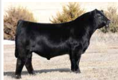
W/C RELENTLESS 32C Paternal Grand sire of Lots 38-42