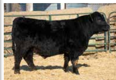
WCS INSTINCT 1537J Maternal Brother to Lot 4