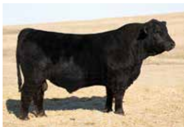
R&R RANSOM J182 Sire of Lots 45-50