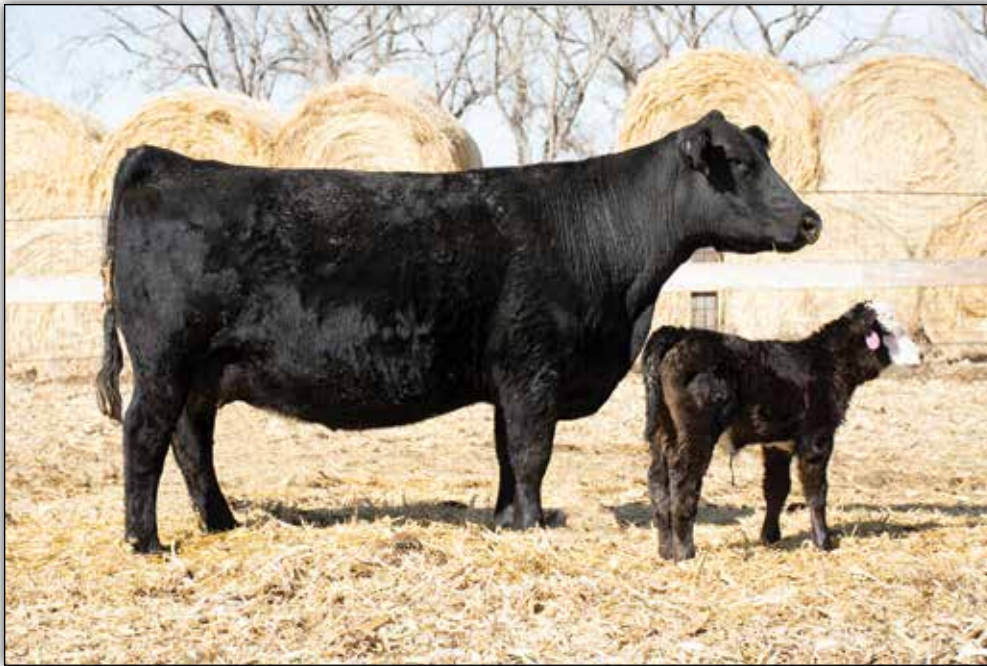
LRS MS ELEVATE 6019D Dam of Lot 100 Flush & Lots 100A-C Embryos