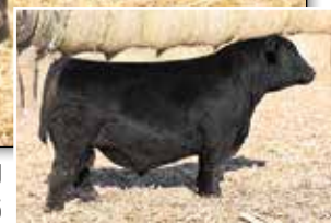
W/C JWC TRIDENT 9727J Sire of Lot 35