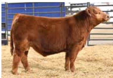
WCS MR RED EMPIRE 2818K Full Brother to Lots 68 & 69