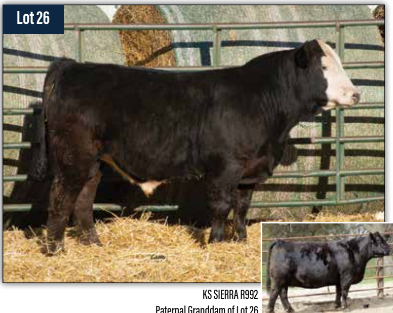
KS SIERRA R99Z Paternal Granddam of Lot 26