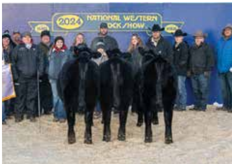
2024 NWSS RESERVE GRAND CHAMPION PEN OF THREE PB SIMMENTAL HEIFERS Full Sisters to Lot 28