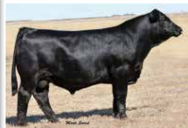
TNGL TRACK ON B748 Maternal Grand sire of Lot 22