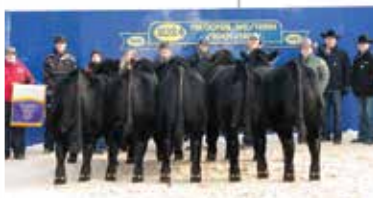
2024 NWSS GRAND CHAMPION PEN OF FIVE PERCENTAGE SIMMENTAL BULLS Lot 1, 2, 6, 15, & 16 made up the winning pen!