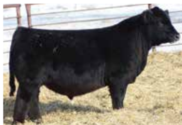
W/C EXPRESS LANE 29G Sire of Lots 70-73