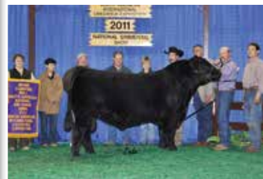
HARKERS BANDITO UNO Maternal Grandsire of Lot 14