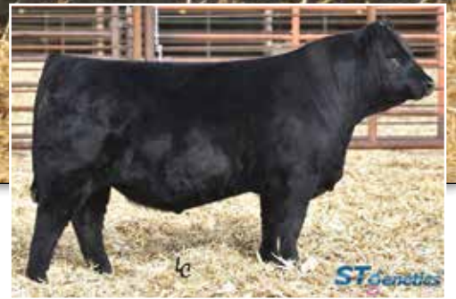
HOOK'S BLACK HAWK 50B Paternal Grand sire of Lots 62 & 63