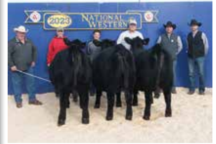
2023 NWSS RESERVE GRAND CHAMPION PEN OF THREE PB SIMMENTAL HEIFERS Daughters of 6019D