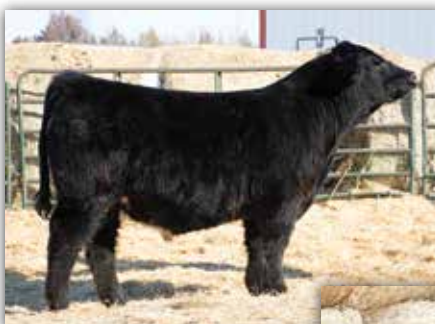
WCS EXPRESS LANE 2821K Maternal Brother to Lot 61