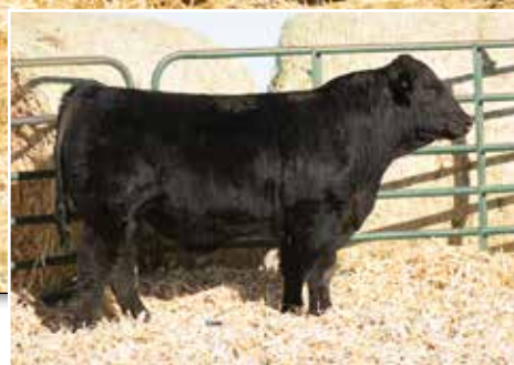
WCS HIGHWAY MAN 1821J Maternal Brother to Lot 70