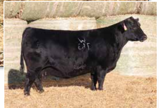
DW SUSANNA 763T Prolific Maternal Granddam of "Trifecta"!