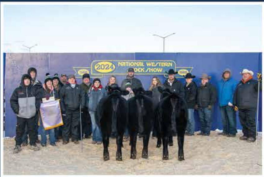
2024 Res. Grand Champion Pen of Three Purebred Females