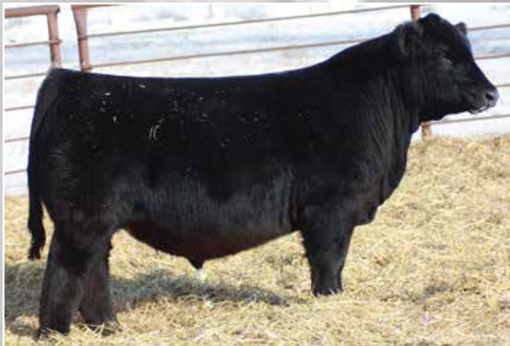
W/C EXPRESS LANE 29G Sire of Lots 1-10