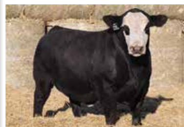
MR W/C TRIFECTA 975J Sire of Lots 33 & 34