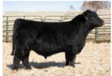
WCS HAMMER LANE 1820J Maternal Brother to Lot 28