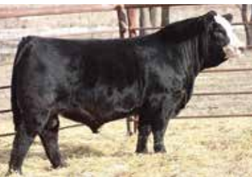
W/C MAINSTAY 355F Sire of Lots 21-25