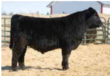
WCS MR LANE 2133K Maternal Brother to Lot 23