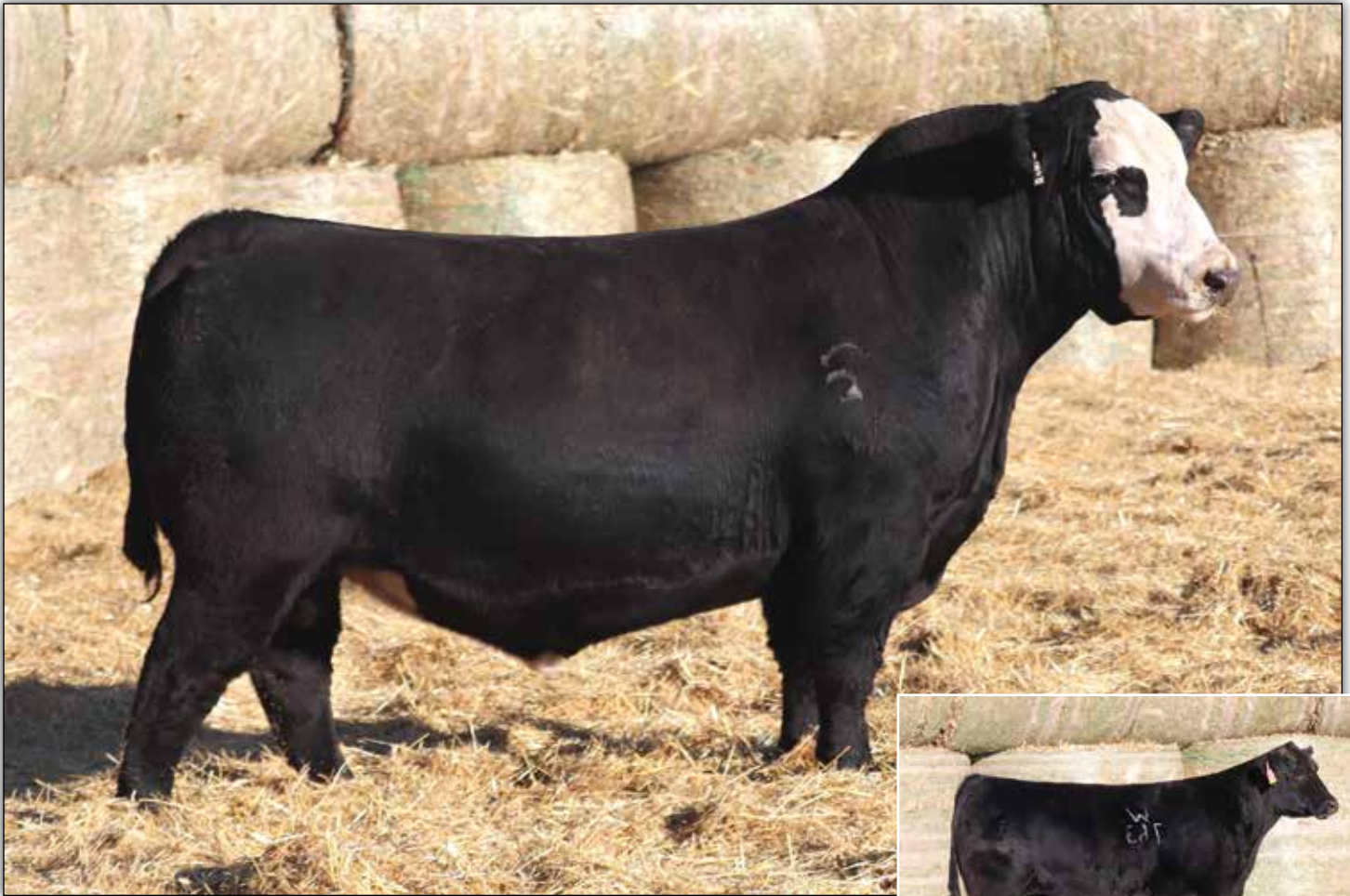
MR W/C TRIFECTA 975J Sire of semen selling!