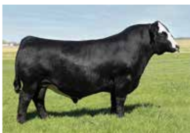
FELT PERSEVERANCE 302F Sire of Lot 65