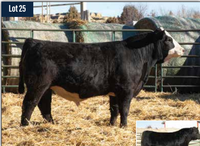
WCS MR VEGAS 035H Maternal Brother to Lot 25