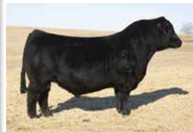
W/C EXPRESS LANE 29G Sire of Lots 29-32