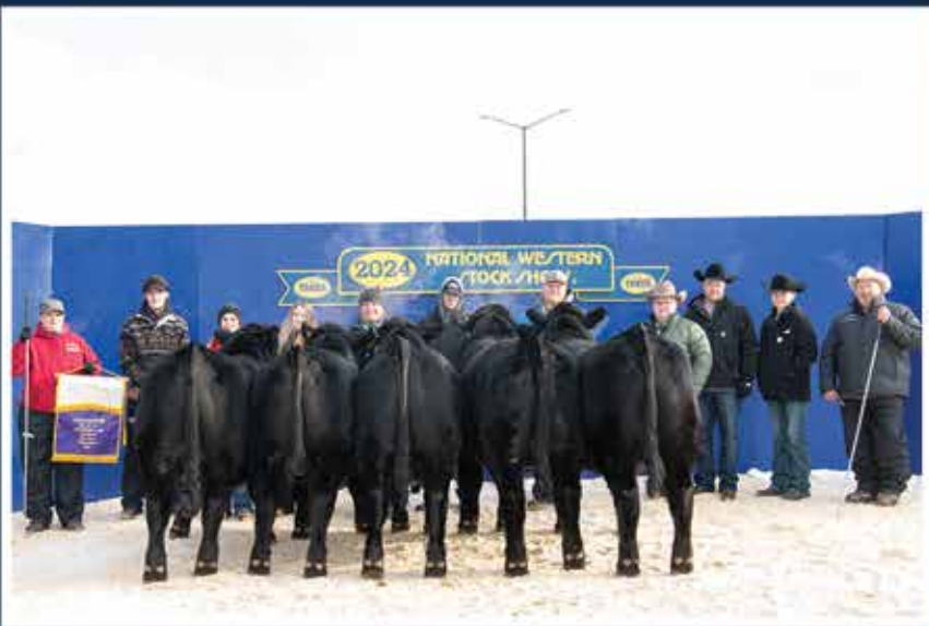
2024 Grand Champion Pen of Five Percentage Bulls