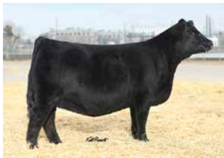
WCS MS HELLCAT 1816J Full Sister to Lot 70