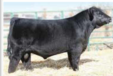
LRS TURNING POINT 3117A Maternal Grandsire of Lot 13