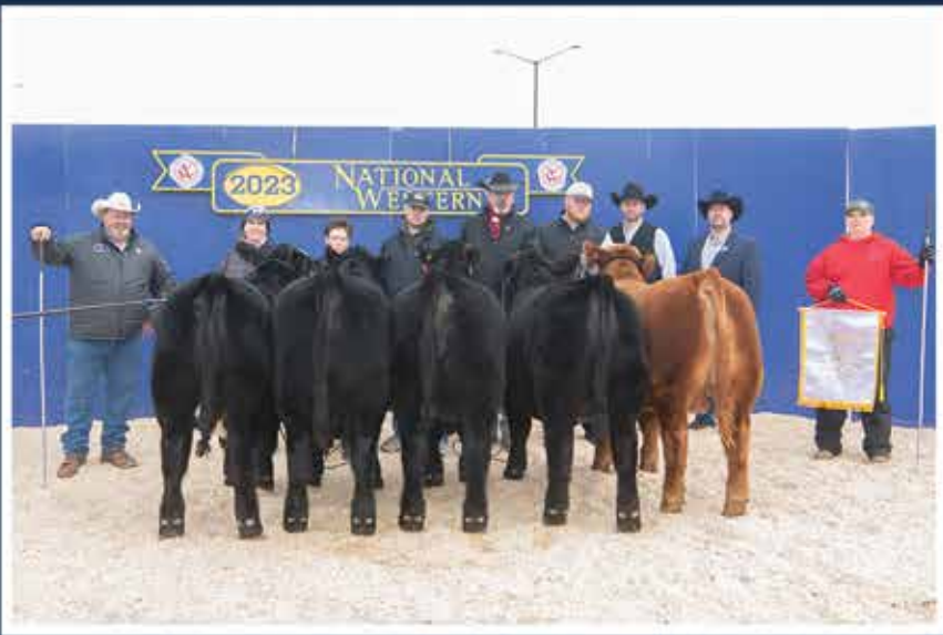
2023 Res. Grand Champion Pen of Five Percentage Bulls