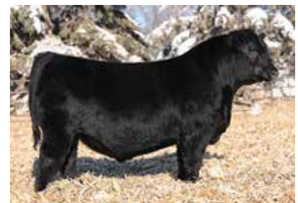
CHESTNUT FORCE 482 $130,000 Sire of Lot 100C