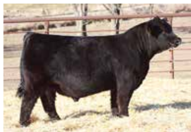
W/C SON OF A BISCUIT 83E Maternal Granddam of Lots 45 & 46