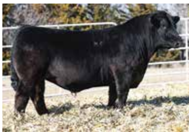
MR SR 71 RIGHT NOW E1538 Paternal Grand sire of Lots 11-20