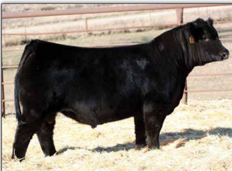
W/C NIGHT WATCH 84E Paternal Grand sire of Lots 36 & 37