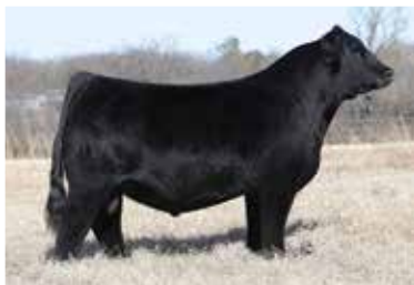
WHF/JS/CCS DOUBLE UP G365 Sire of Lot 64