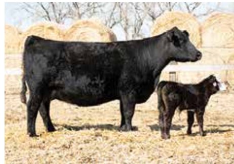
LRS MS ELEVATE 6019D Dam of Lot 28