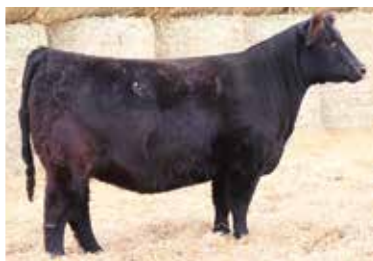
W/C BARBARAMERE 9135G Dam of Lot 32