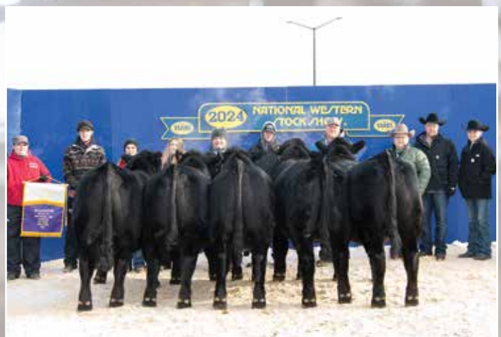
2024 NWSS GRAND CHAMPION PEN OF FIVE PERCENTAGE SIMMENTAL BULLS Lot 1, 2, 6, 15, & 16 made up the winning pen!