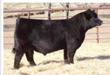
W/C SON OF A BISCUIT 83E Maternal Grandsire of Lot 58