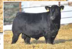
RUST NIGHT WATCH 5G Sire of Lot 36 & 37