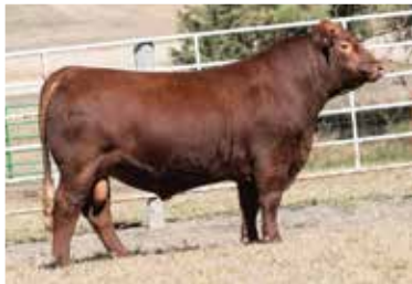
BAR CK RED EMPIRE 9153G Sire of Lots 68 & 69