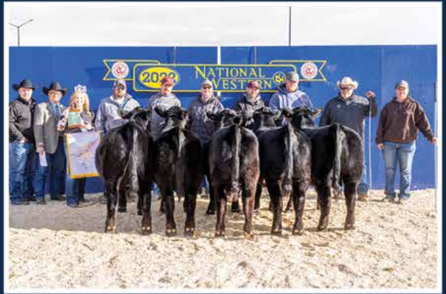
2022 Res. Grand Champion Pen of Five Percentage Bulls