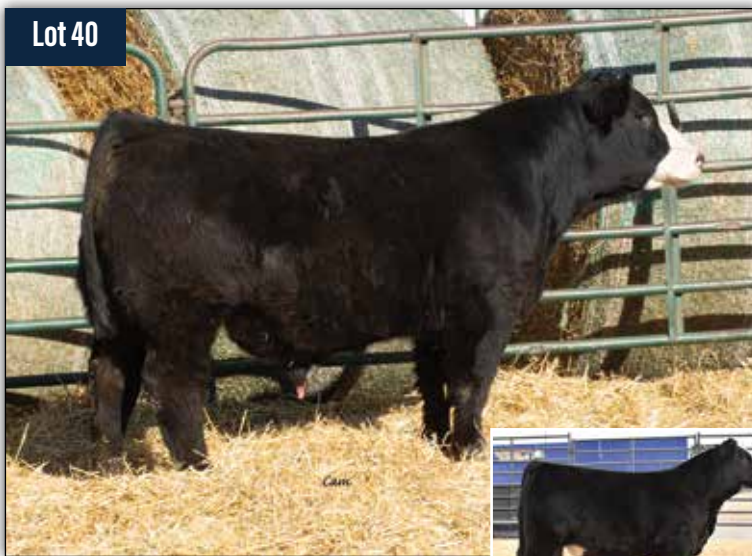
WCS MR STAY 2121K Maternal Brother to Lot 40