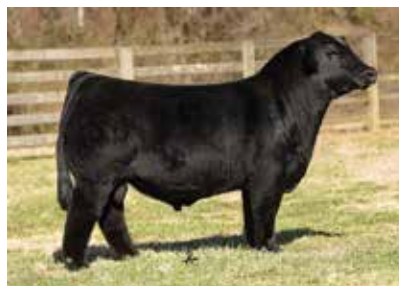
WHF GREATER GOOD J45 Sire of Lot 100B