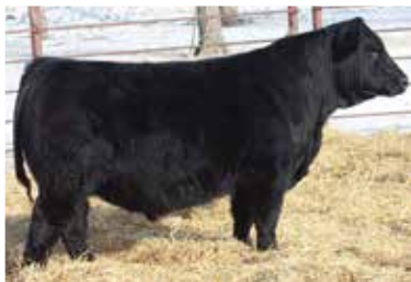
W/C REST EASY 752G Sire of Lots 11-20