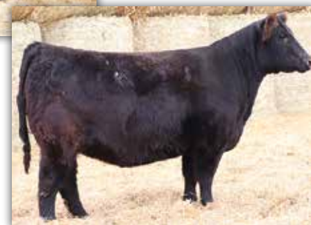
W/C BARBARAMERE 9135G Dam of Lot 61