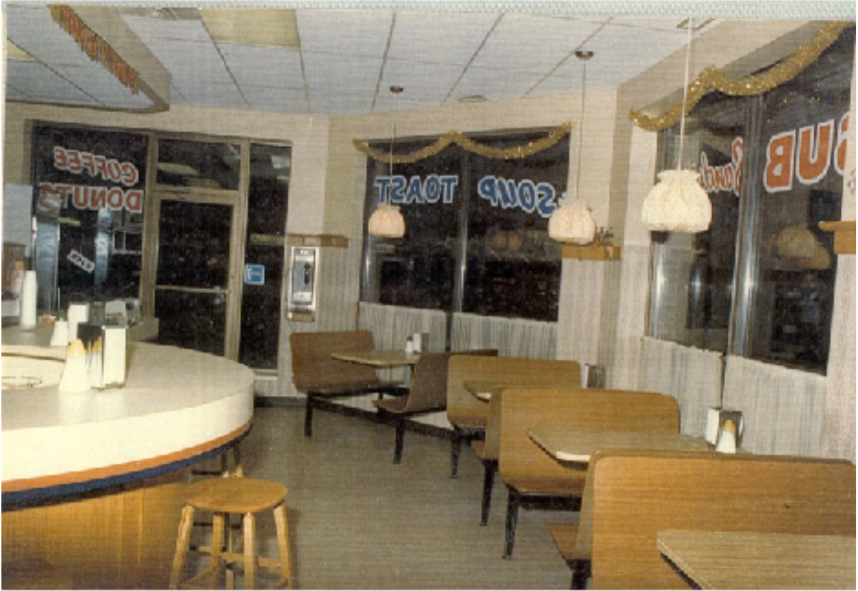
(View from the interior looking out to the parking lot)