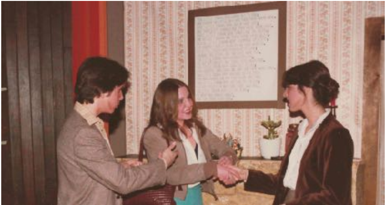
(A scene from the school play "And Then There Were None")

She had big dreams and wanted to become a famous actress. She studied acting at the Manitoba Theatre Workshop and after tryouts on December 9 had been given the lead role in her school's annual play.