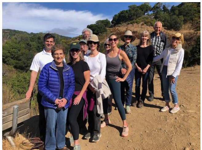
October 14 th Walk About Group