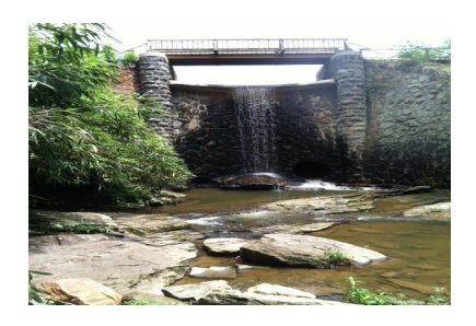
Waterfall at the bass pond in the Biltmore Gardens.

I do rate the Southern cities, especial-