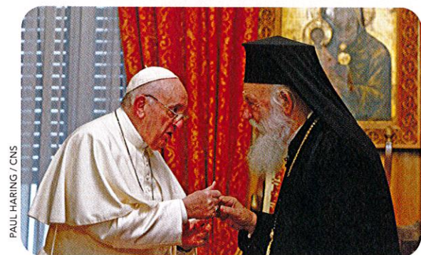
PAUL HARING / CNS