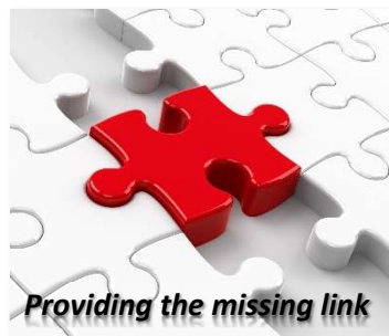
Providing the missing link

Hence, we form communities of like-minded individuals who band together to co-operate to achieve multiple targets together. There are too many elements that we must solve to be done by one person alone, and through the cooperation of the group, we deliver superior outcomes.