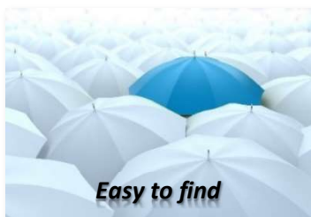
Easy to find

The strengths in the bricks and mortar business model have eroded, leaving a landscape of geographically and technologically isolated customers. Most suffering