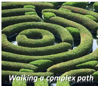
Walking a complex path

Some of these upheavals are human made, but others are because of convergences of natural events exacerbated by our ever-growing hunger for knowledge and resources. The demands and diversity of the challenges we face require us to be experts at everything, but time does not allow us to be that, and we end up having to specialise.