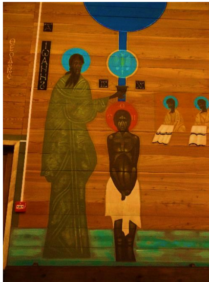
Jerzy Nowosielski The Baptism of Christ

3427 Olney Laytonsville Rd. Olney, MD 20832