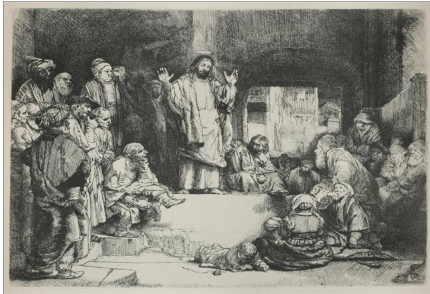
REMBRANDT "LA PETITE TOMBE"

3427 Olney Laytonsville Rd. Olney, MD 20832