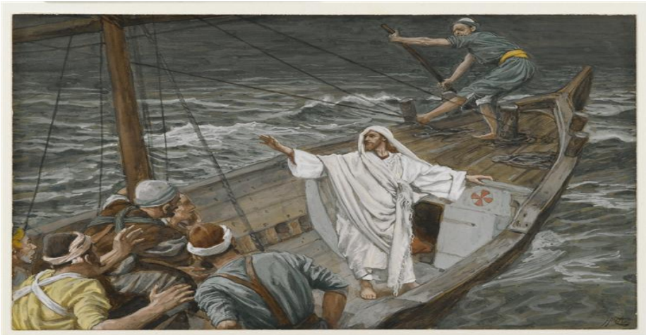
JAMES TISSOT-JESUS CALMANT LA TEMPERE

3427 Olney Laytonsville Rd. Olney, MD 20832