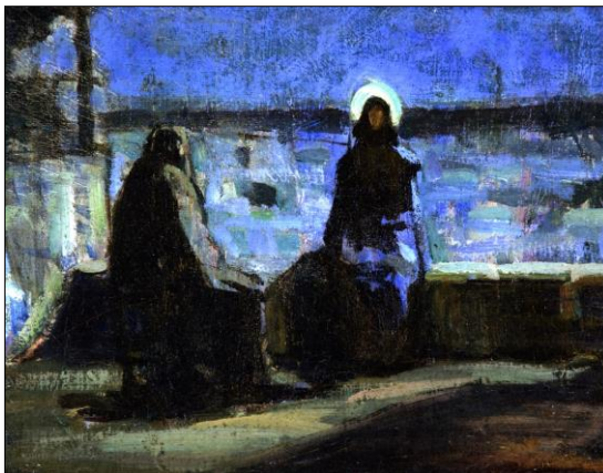
Study For Nicodemus Visiting Jesus by Henry Ossawa Tanner

3427 Olney Laytonsville Rd. Olney, MD 20832