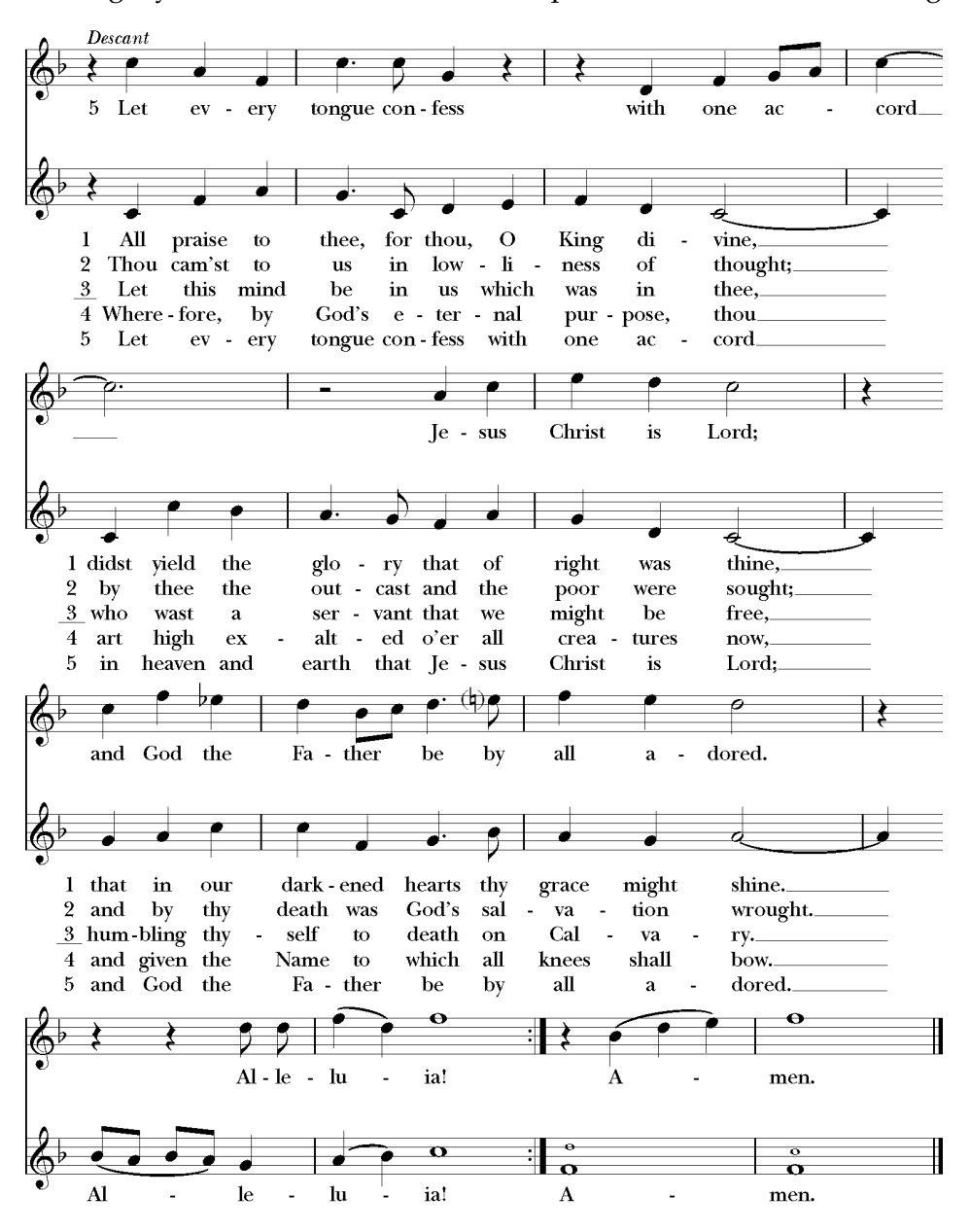
All praise to thee, for thou, O King divine