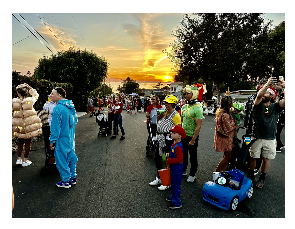
Halloween at Oak Street