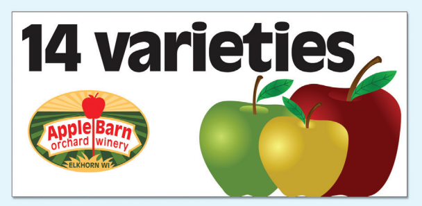
Outdoor Awareness Campaign: CD, AD, Copy-writing, Branding, Illustration, Production