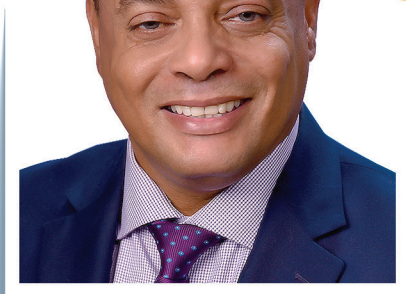
Message from The President, Southern College