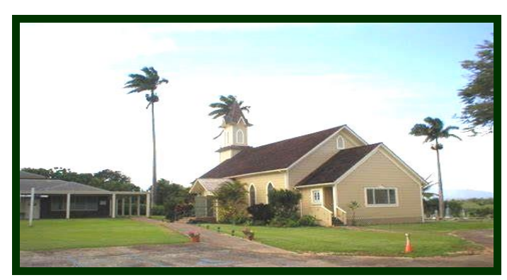
Room 8, 4602 Hoomana Rd. (on German Hill)