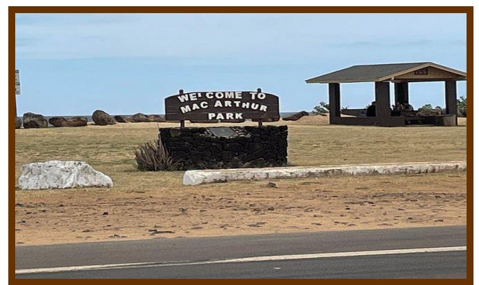
Kekaha Beach Park, Waimea