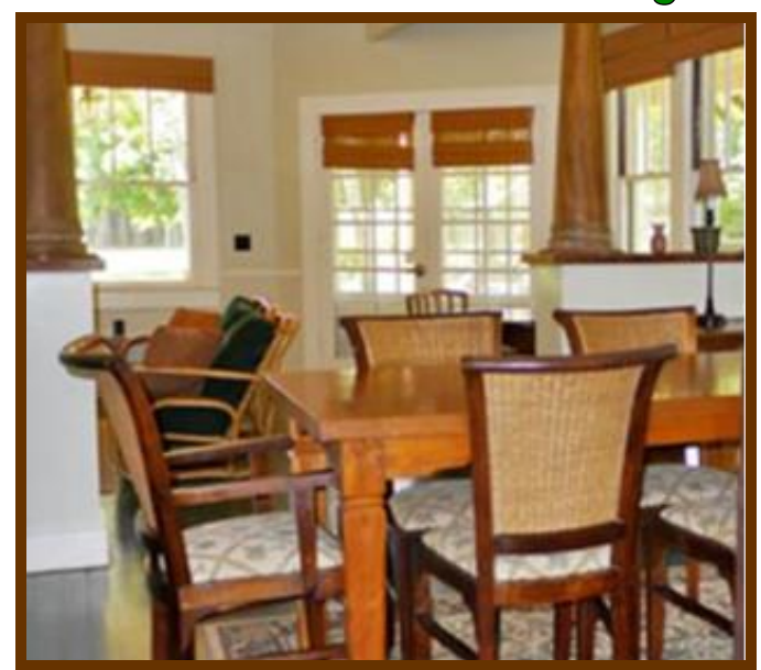
9400 Kaumualii Hwy, Waimea -Conference Room -