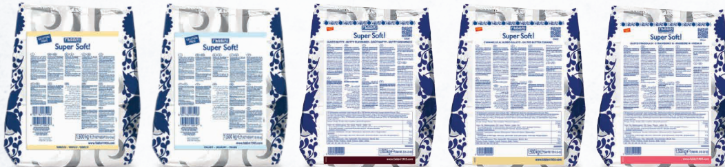
SUPERSOFT! VANILLA Code 9236394