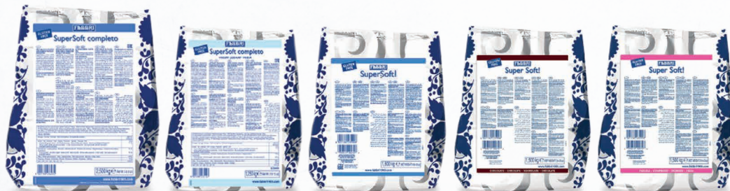
SUPERSOFT! COMPLETE Code 9236377

Fabbri 1905 has a range of complete and balanced cold-soluble powdered preparations for making the mixture to use in Soft-Ice machines. A vast selection of flavours that will make your offering even more tempting. These powdered preparations are already flavoured and make your ice cream even softer and creamier , ensuring top-quality results .