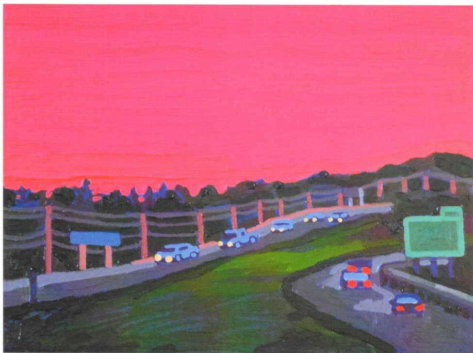
Red Highway, oil on canvas, 12" x 16"