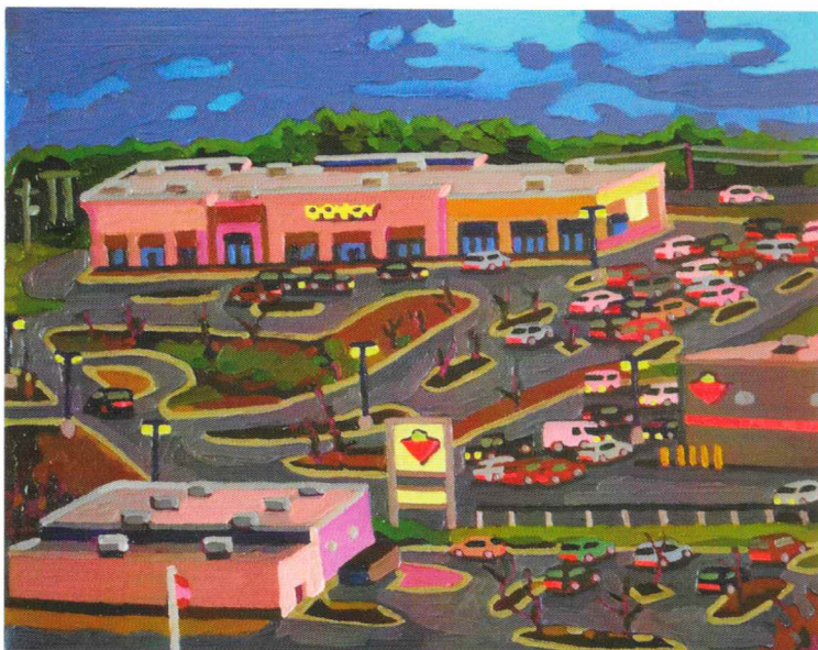
Mall Park, oil on canvas, 16" x 20"