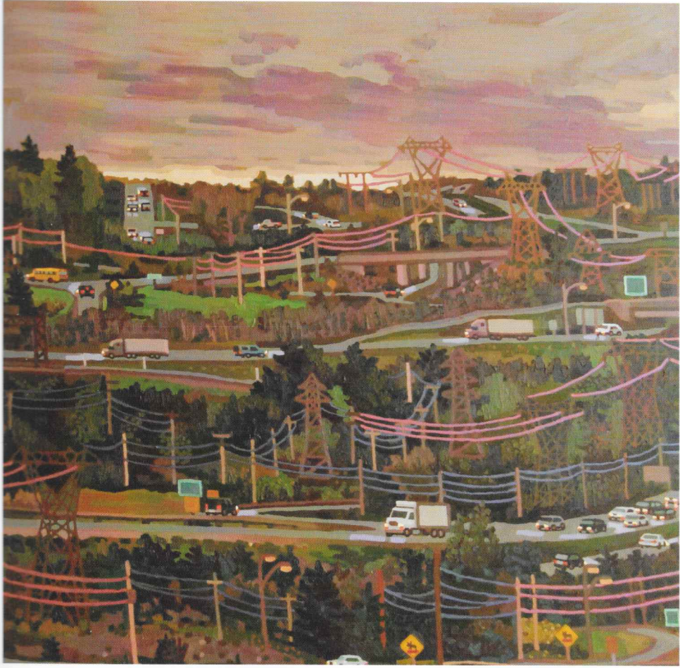
power/moose, oil on canvas, 60" x 60"