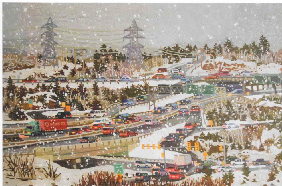
snowy highway, oil on canvas, 48" x 72"