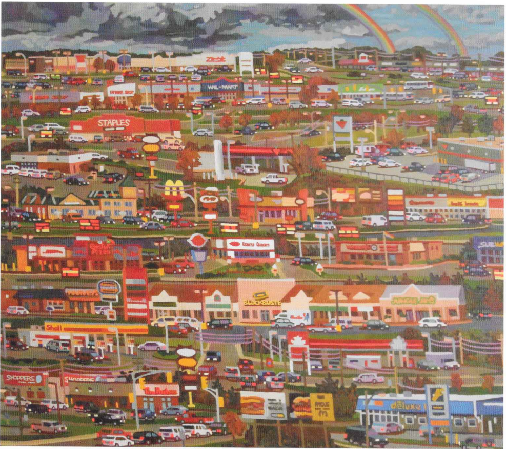
rainbow over canadian tire, oil on canvas, 60" x 65"

He is held in the collection of the Beaverbrook Art Gallery, The New Brunswick Art Bank, Art Bank of Canada, Department of Foreign Affairs Canada, and The Colart Collection, Montreal PQ.