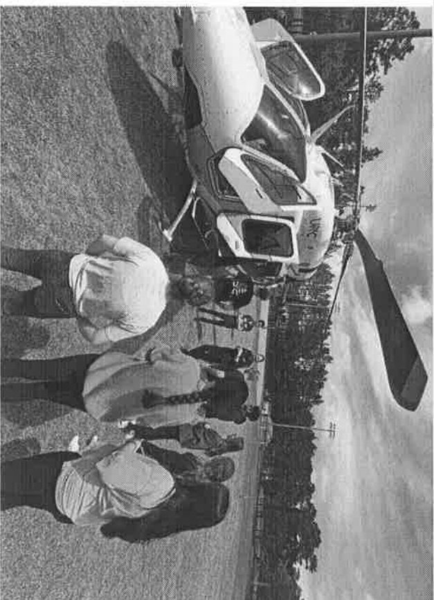
April 28th: Air Care Class with Sandhills CC Paramedic Students