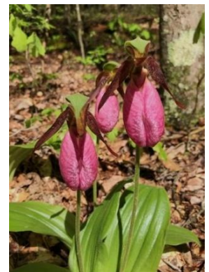
Cypripedium acaule

The Native Orchid Preservation and Education Society (NOPES) has invited GCOS to share their fieldtrip to Shawnee State Park near West Portsmouth, Ohio. Hiking is minimal but it's been wet enough, the ground may be muddy in places, and a trekking pole is a good friend. Pack a lunch and water. Don't forget insect and sun protection too. The pink and yellow lady's slippers are abundant right now. This is the perfect area to view them as well as other wildflowers.