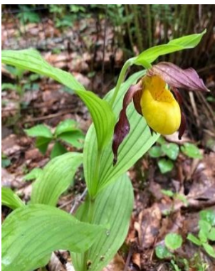
Cypripedium pubescens

The spring orchids in southwestern OH are going strong and you can see them this Saturday, May 10, from about 9:00-4:00.