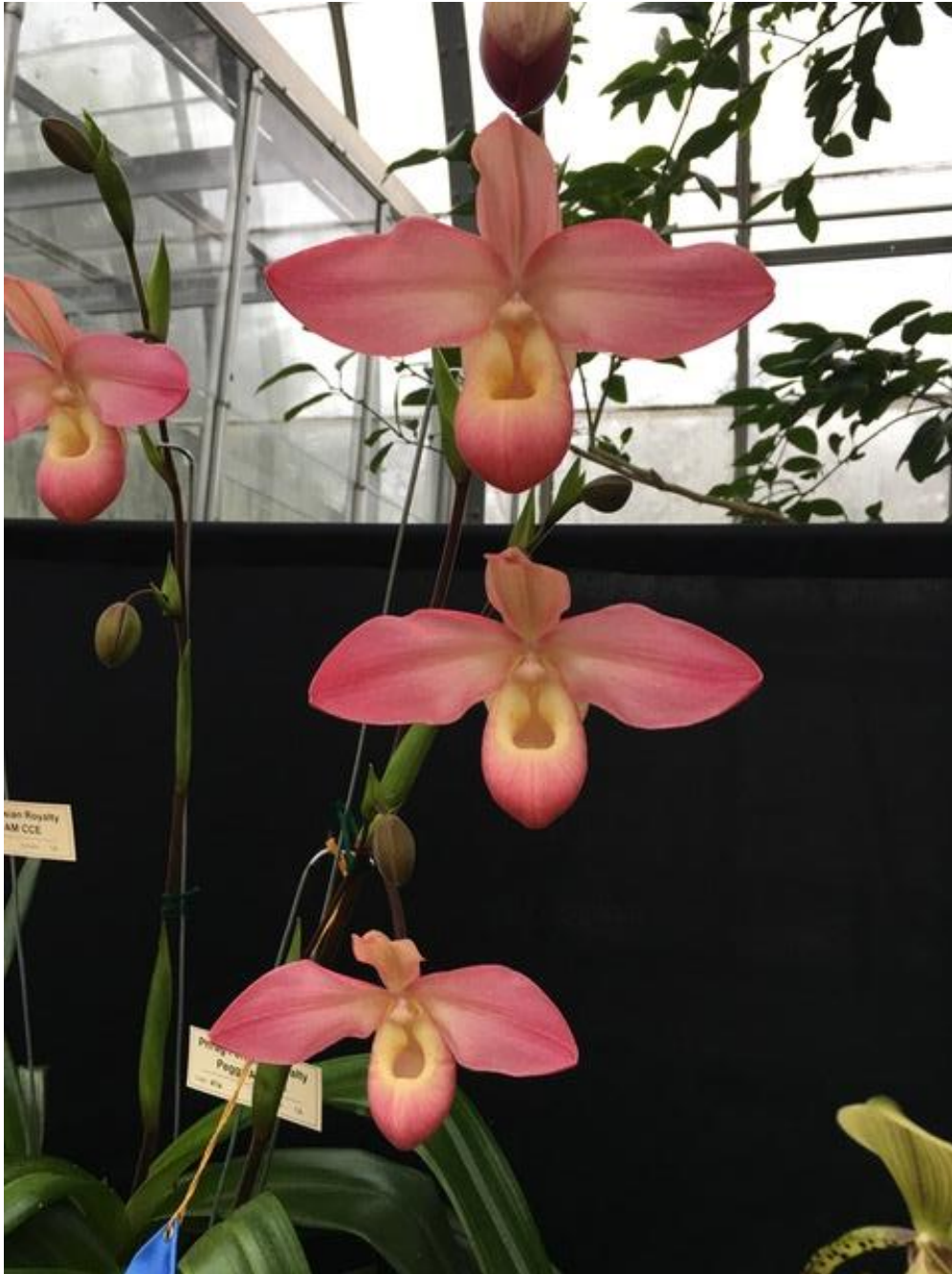
Phrag. Perusian Royalty' Peggy' AM/CCE/AOS