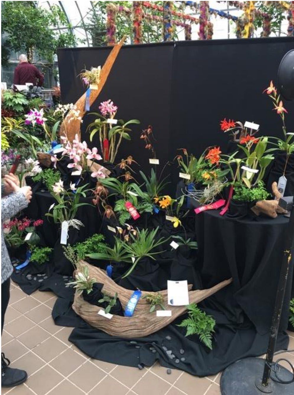
Greater Cincinnati Orchid Society exhibit