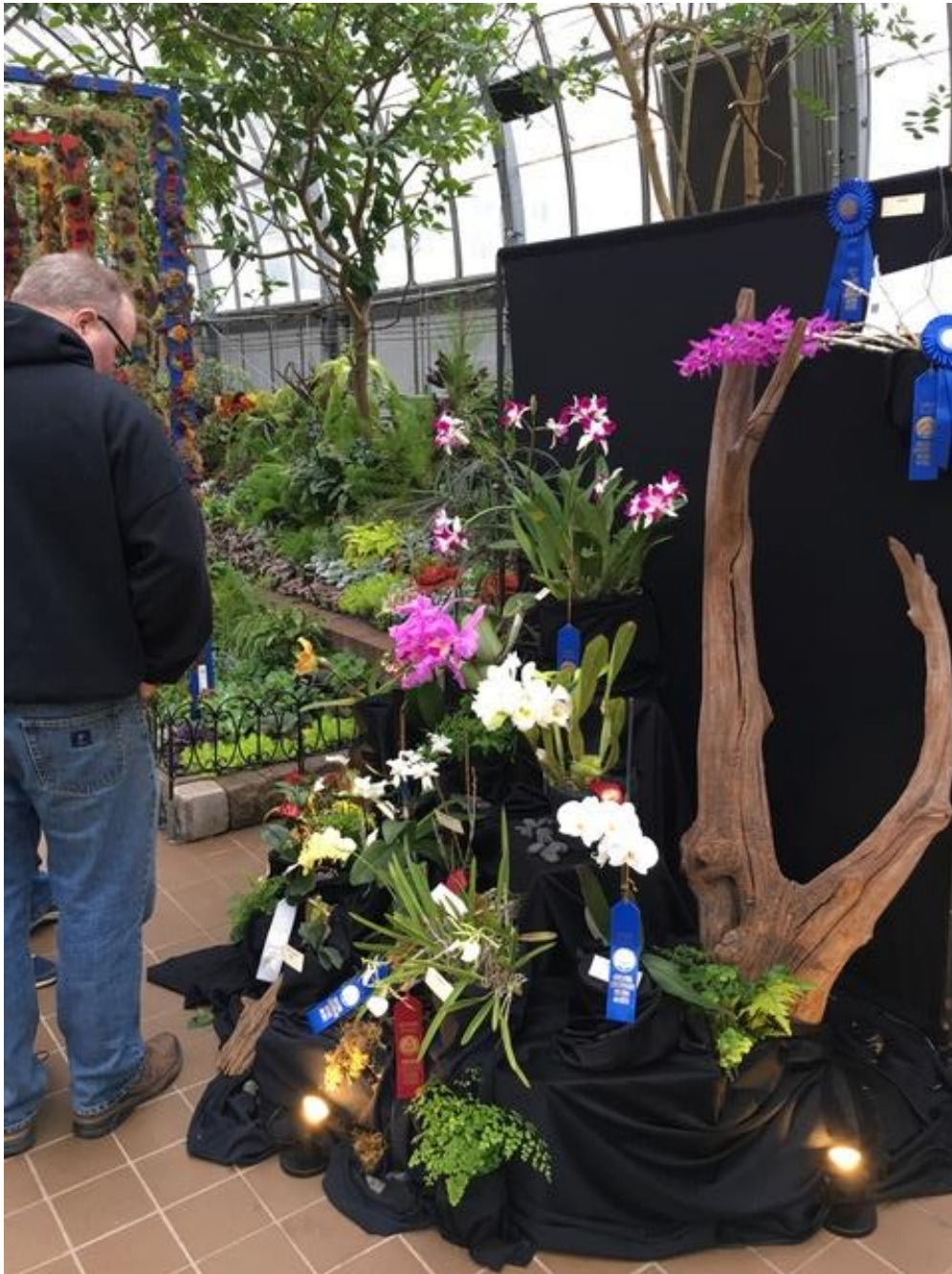
Greater Cincinnati Orchid Society beginners exhibit