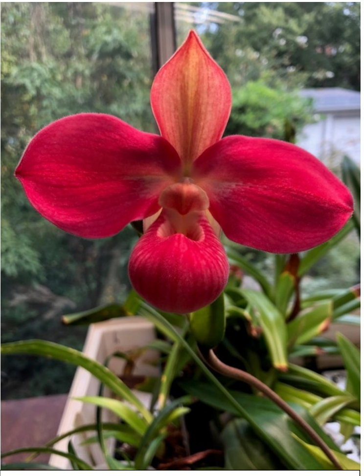
Phragmipedium Peruflora's Cirila Alca

The Mini Show we recently had at Krohn was a success thanks to our volunteers and vendors. This event went smoothly under the current conditions and we hope to have another show this Spring 'Knock on Wood'. Ribbon and class awards were presented to those outstanding orchids