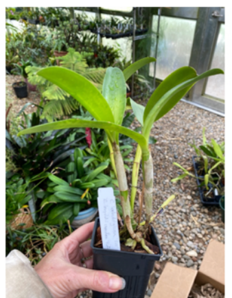
C. leoloddiglossa , 'SVO' X C. leopoldii coerulea 'Kathleen 'JC/AOS Minimum $15

Top plant is auction plant. Bottom pictures are parents. These will be enlarged for auction.