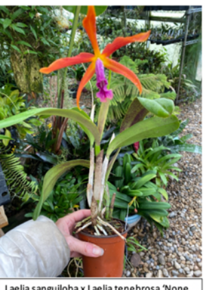
Laelia <mark>sanguiloba x</mark> Laelia <u>tenebrosa</u> 'None Darker!' Minimum $15