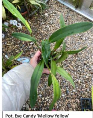
Pot. Eye Candy 'Mellow Yellow' Minimum $15