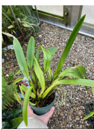
Schombolaela Summit 'Tomiko' HCC/AOS x self Minimum $20