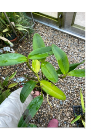
C. leopoldii 'SVO' AM/AOS x C. leopoldii 'Paul' AM/AOS Minimum $20