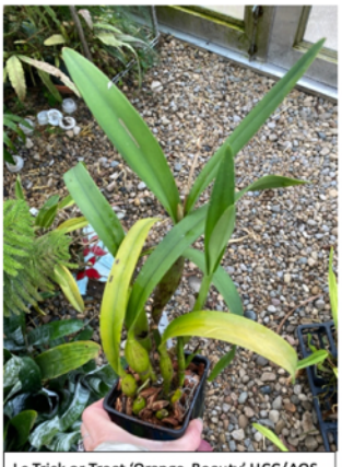
Lc Trick or Treat 'Orange Beauty' HCC/AOS x Epc. Kyoguchi 'M. Sauno' mutation Minimum $20