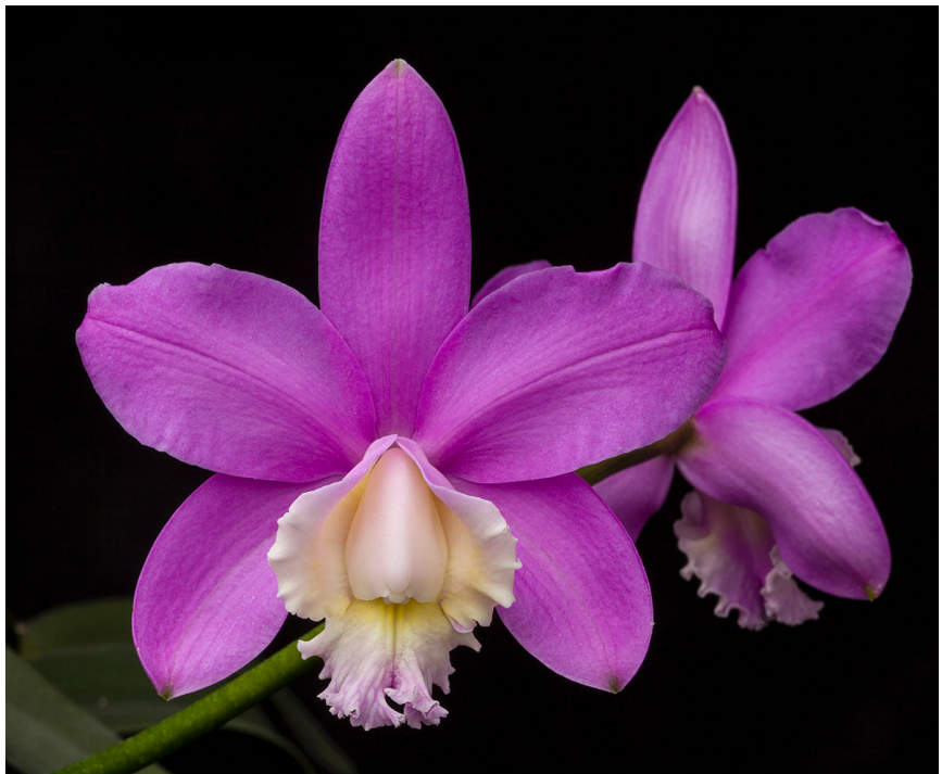
Cattleya harrisoniana 'Volcano Queen' AM/AOS

The Greater Cincinnati Orchid Society hopes everyone is staying healthy. Be sure to catch all the changes to our activities as we social distance. While we normally meet at the Civic Garden Center, we plan, at present, to meet online with Zoom. We will be emailing Zoom meeting information for our society and for other societies as they offer their meetings to our members. We are also sharing members' orchids with an online Show-and-Tell.