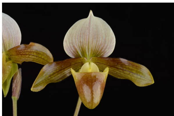
Paphiopedilum Hung Shen Venus "Oakwood's Charming Venus" HCC/ AOS - 77 Points - Oakwood

If you have not yet taken the opportunity to attend the Cincinnati Judging Center to take plants or just sit in with a judging team to see how it work, I would encourage you to give it a try! Judges are friendly and willing to answer questions and help you learn!