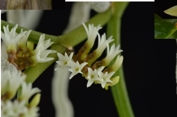
Campylocentrum ornithorrhynchum 'Mindy Baxter' CBR/ AOS - Eric Sauer