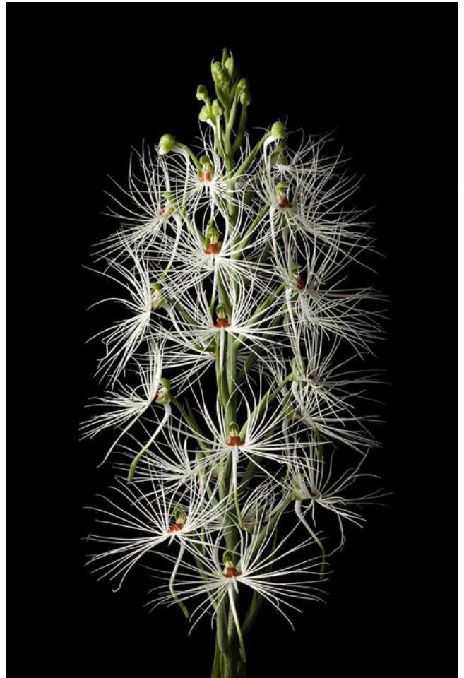
Habenaria medusa

On Saturday, June 18 at 11 am we shall resume a very popular tradition: our annual picnic/ auction with the Miami Valley Orchid Society. Always a lot of fun with great food and auctions (silent and