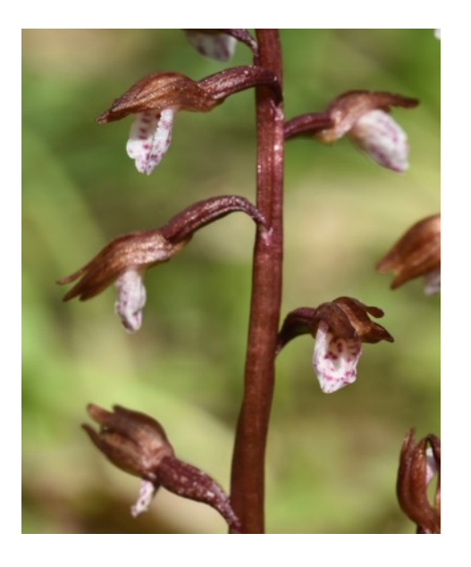
wide. Petals and sepals converge to form a hood over the lip. Flowers normally chasmogamous." <sup>2</sup>

The plant description is as follows: "Plant glabrous, leafless, with reddish to yellowish, fleshy stem 20-30 cm tall. Roots absent. Rhizome multibranched, coralloid. Inflorescence a loose raceme of 8-14 flowers, each subtended by a minute floral bract. Lip 5-6 mm long x 3-4 mm wide. Sepals similar to petals, 5-6 mm long x 1-1.3 mm wide, ovate, entire, white with purple spots. Petals lanceolate, yellowish to purplish-brown, 4-5 mm long x 1 mm wide. Sepals similar to petals, 5-6 mm long x 1-1.3 mm