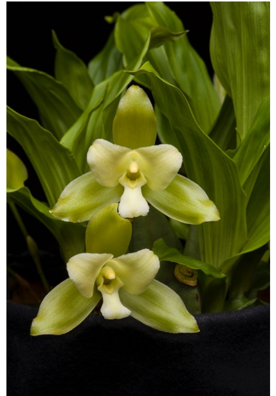
Lyc. Lemon Twist