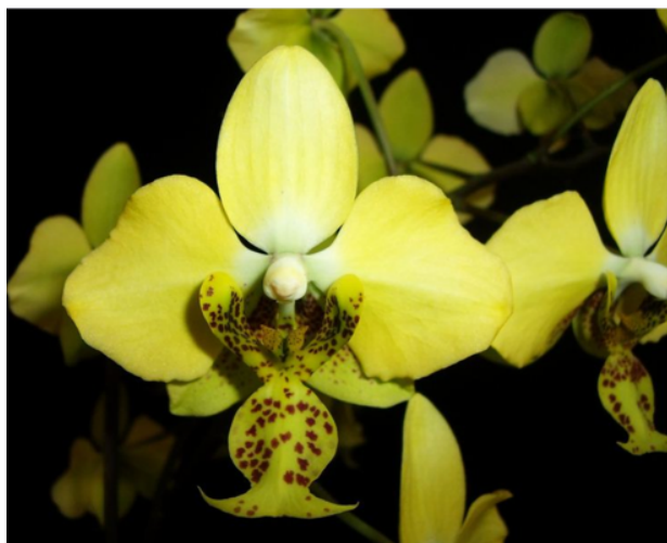
Phalaenopsis stuartiana f. nobilis 'Paraiso Tropical' Exhibitor: Carlos Fighetti