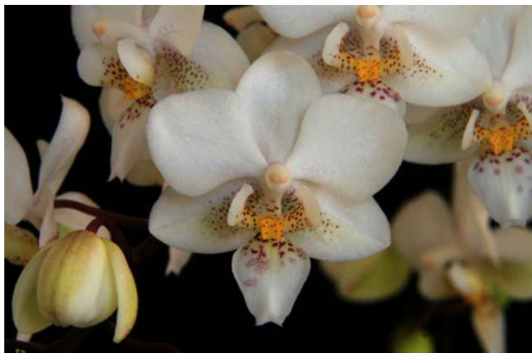
Phalaenopsis Nobby's Snow Fairy 'Cloud Pixie' Exhibitor: Renee & Marvin Gerber

It can be repotted at any time of the year, but best time is when new roots emerge. Best media is bark-based compost.