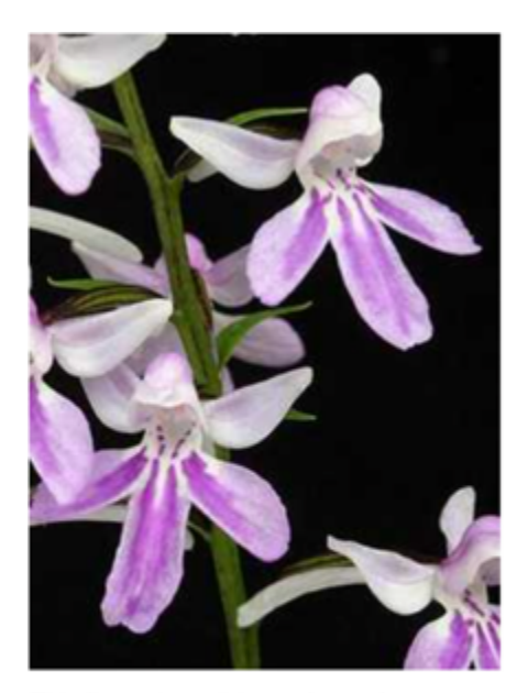
This flower is a wild type form of Ponerorchis graminifolia. The lip is much reduced in size and the flower is a bit smaller than selectively bred ones.

Gunther Kleinhans states that earlier hybrids were made with Ponerorchis chidori and Amitostigma gracile and that some of today's cultivars may have come from these earlier hybrids allowing for the variety seen in today's plants. These same hybrids have been reported to be in cultivation