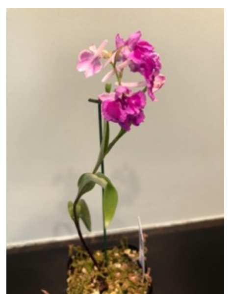
Note spur found at back of flower

Flowers are \frac{1}{4} to \frac{1}{2} inch across. Colors range from lilac pink to rosy purple. The alba form is rare. Plants tend to grow in groups. They like bright light but little direct sunlight and high humidity.