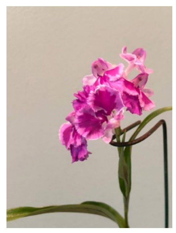
Barry's first bloom seedling, which of course bloomed pink!

This terrestrial orchid grows from small tubers the size of peas. Buds emerge from the tubers in early spring producing 2 to 4 basal and cauline leaves 2 to 4 inches long. Five to twenty flowers are produced on an inflorescence. It blooms in June or July.