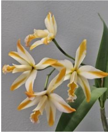
Ctt. Candy Corn

Registered by Stewart Inc. in 1982. Cross of C. Dubiosa (syn C. Dubiosa (1980)) and Ctt. Trick or Treat . The species that make up this cross are: C. harrisoniana , C. trianae , C. cinnabarina , Gur. aurantiaca , C. crispata and C. harpophylla .