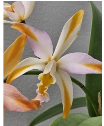
Ctt. Candy Corn