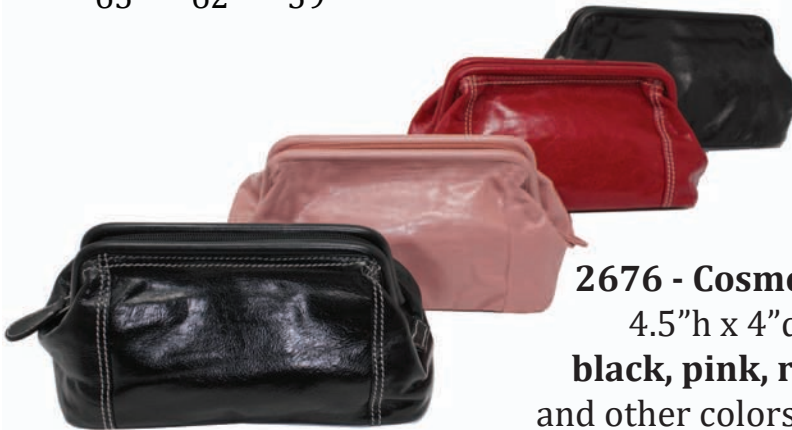
2676 - Cosmetic Case