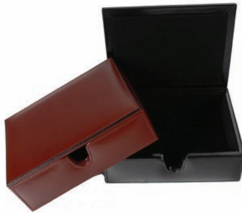
7544 - Desk Box (MD) 8" h x 2.5" d x 6" l black & walnut