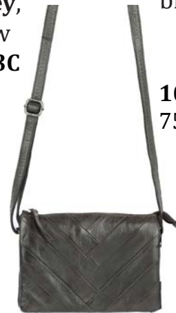
3109 Sunny Crossbody 6"h x 2"d x 8.5"l charcoal, cognac, honey, grey, tan, olive 10 100 500+ 3C 82 79 76