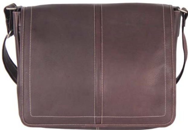
0850 - Acadia Messenger Bag

10 100 500+ 3C 0865 131 126 121 0866 149 142 135