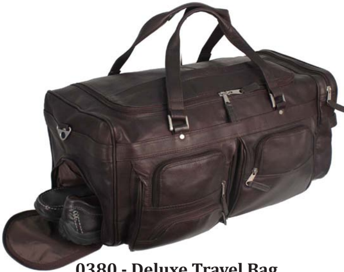
0380 - Deluxe Travel Bag

10.5”h x 10”d x 22”l black, natural, & cafe 10 100 500+ 3C 234 224 214