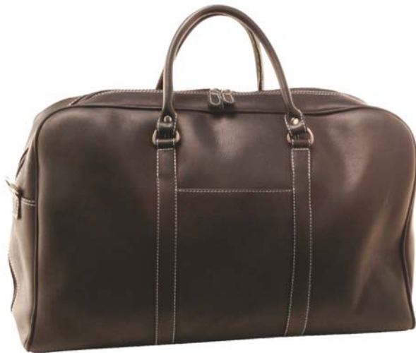
0355 - Cabin Duffel

11.5”h x 10”d x 22.5”l black, natural & cafe 10 100 500+ 3C 210 202 194