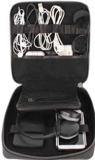
0820 - Tech Travel Kit (MD) 5.5" h x 2" d x 9" l