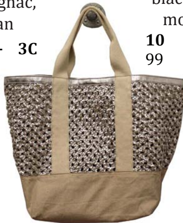
4626 Greta Tote 16"h x 8.5"d x 22"l black, gold, silver 10 100 500+ 3C 165 157 149