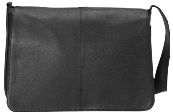
2413 - Yellowstone Messenger Bag