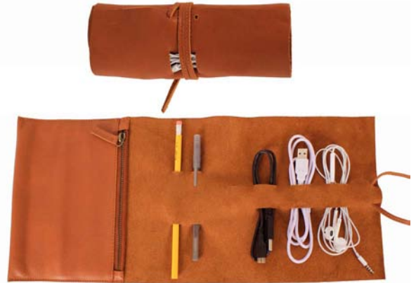
0825 - Tech and Accessory Roll 8" h x 18.75" l (open)