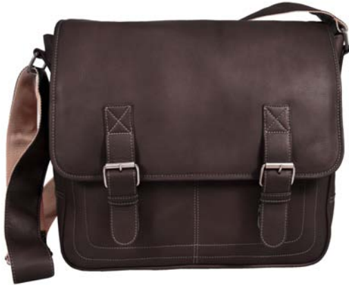
0888 - Adventurer Messenger Bag