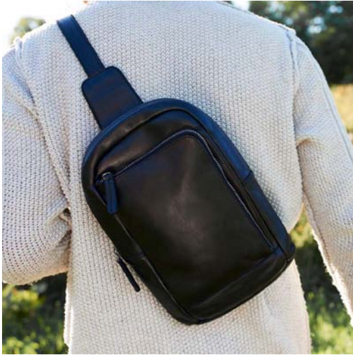
1500 - Austin Sling 11.5”h x 2.5”d x 7.5”l black, brown