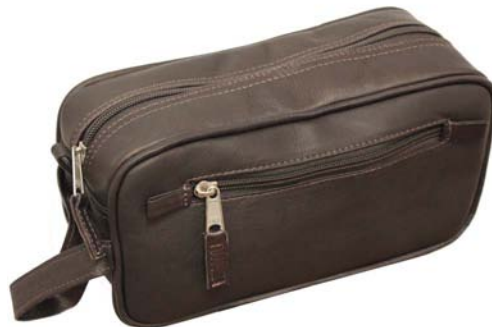
0209 - Downtown Travel Kit