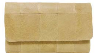
3104 Cort Wallet 4.5"h x 1"d x 7"l black, honey , cognac 10 100 500+ 3C 65 62 59