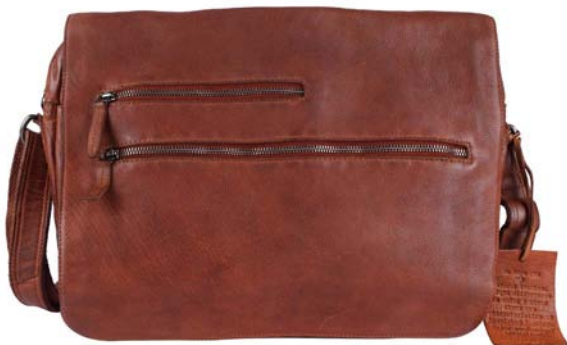
1502 - Spring Street Messenger Bag