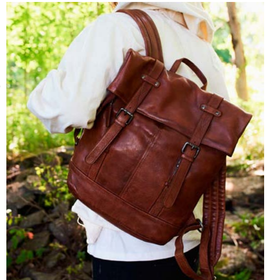
1503 - Barcelona Backpack 15”h x 4”d x 13”l black, brown, cognac