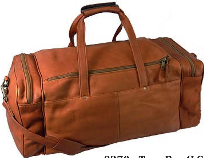
0370 - Tour Bag (LG) 10.5”h x 9.25”d x 22”l black, natural & cafe 10 100 500+ 3C 200 192 184