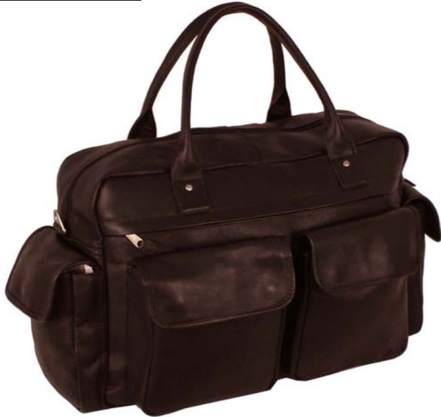
7735 - Corolla Carry-On

12”h x 5.5”d x 17”l black, natural & cafe