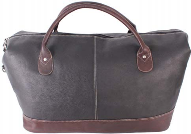
0340 - Carmel Weekender 13”h x 10”d x 20”l black with cafe trim cafe with black trim 10 100 500+ 3C 182 174 166