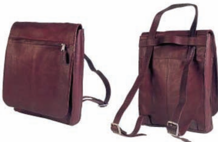
0573 - North/South Convertible Laptop Shoulder Bag/Backpack