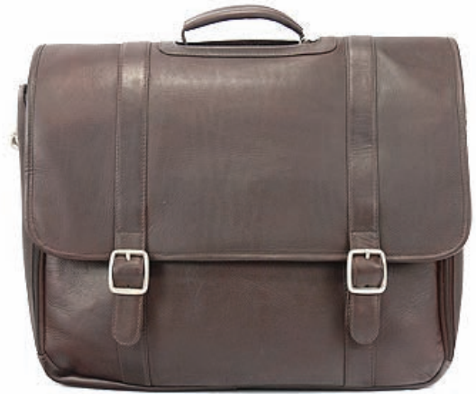
0981 - Wall Street Laptop Brief