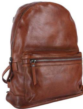
3183 - Baxter Backpack 13.5”h x 4.5”d x 11”l black, cognac, charcoal, olive