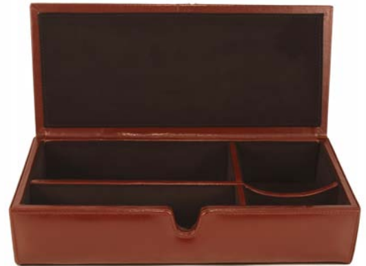
7545 - Desk Box (LG) 5.5" h x 2.5" d x 12.5" l black & walnut