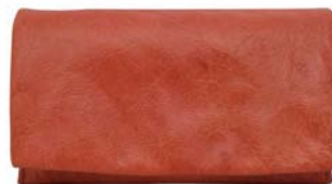
4655 Eloise Wallet 4"h x .5"d x 7.25"l black, bluestone, grey, pink, poppy , sand 10 100 500+ 3C 32 31 30