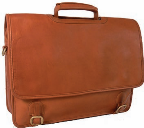
0956 - Grammercy Park Laptop Brief