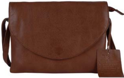
3152 - Marcus Crossbody 7.5"h x 2"d x 10"l black, brown , cognac, honey, grey, tan 10 100 500+ 3C 115 110 106