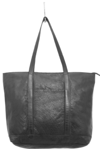
3625 - Cali Tote