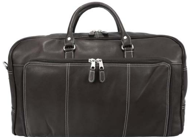
0360 - Las Vegas Weekender 12”h x 9”d x 21”l black, natural & cafe 10 100 500+ 3C 200 192 184