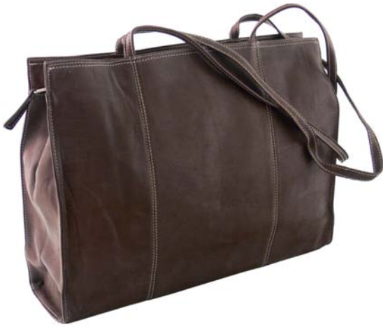
0239 - The Urban Tote