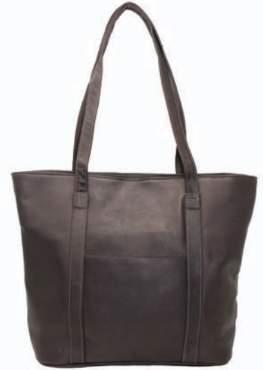
0229 - Suburban Tote (MD)