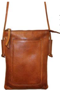
5111 Miller Crossbody 9"h x .5"d x 6.75"l black, cognac , tan, grey 10 100 500+ 3C 73 70 67