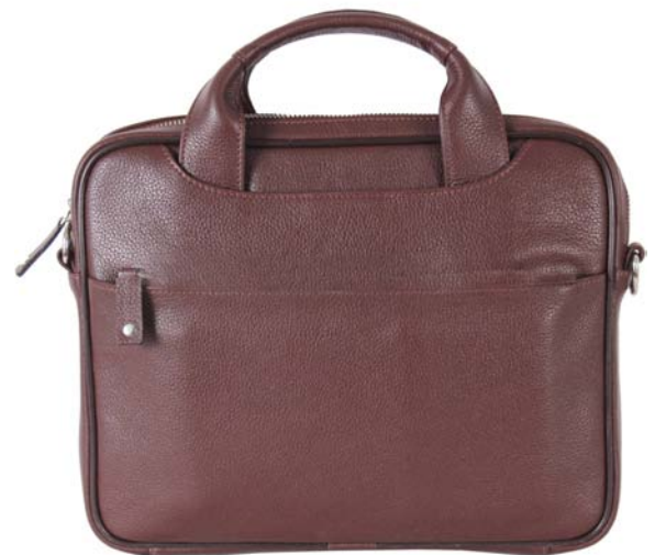
2410 - Tablet Case