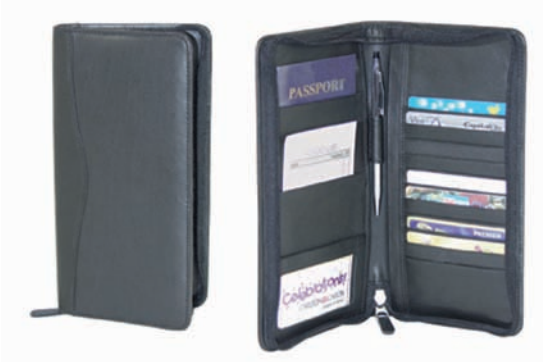
0186 - Travel Wallet/ Passport Case