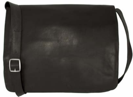
0865 - Yosemite Messenger Bag (MD)