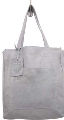
2623 - Margie Tote 14.5"h x 4.5"d x 12"l black, charcoal, grey , mocha, tan, yellow 10 100 500+ 3C 99 95 91