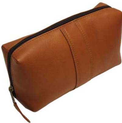
0202 - West Side Travel Kit