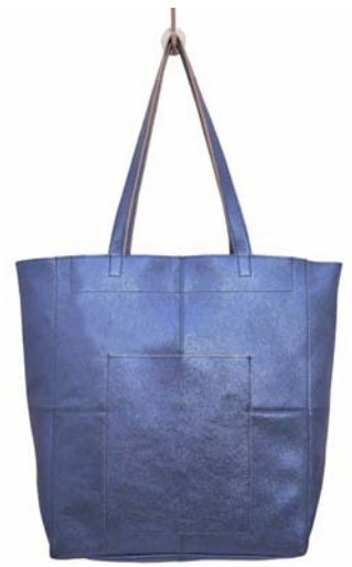
4623 Amelia Tote 14.5"h x 4.5"d x 12"l black, dark sapphire , metallic brown, rosé, copper 10 100 500+ 3C 75 72 69