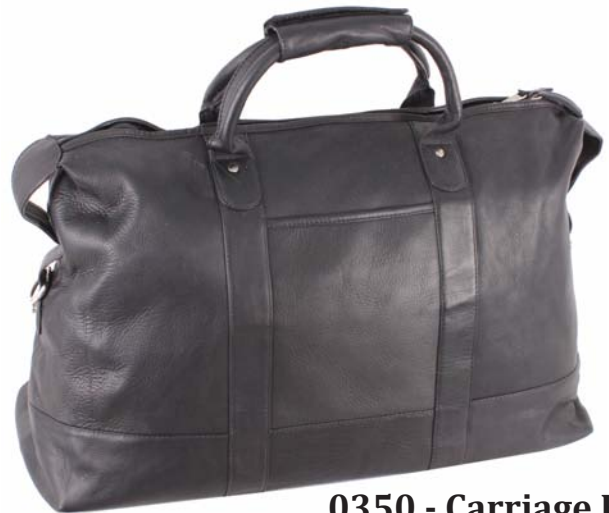
0350 - Carriage Bag