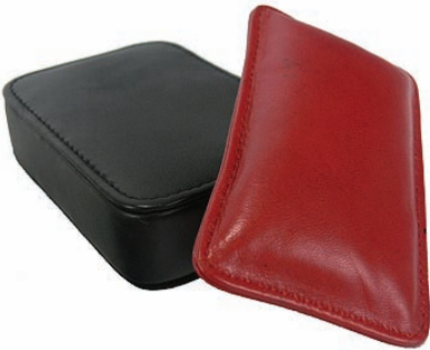
7546 - Framed Paperweight (shown in black)