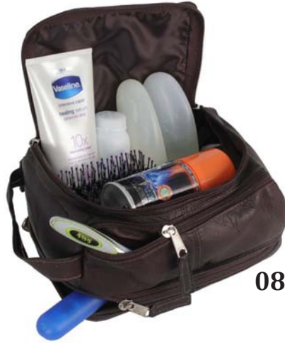
0811 - South Side Travel Kit