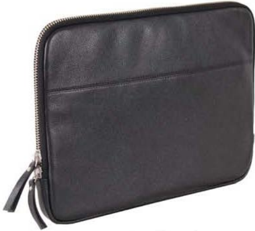
2415 - Zippered Tablet/Laptop Case