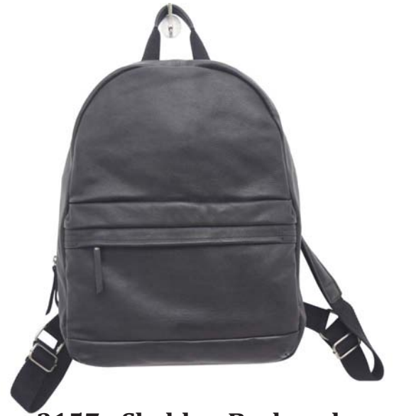
3157 - Sheldon Backpack 16.5”h x 4”d x 12”l black, brown, cognac