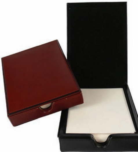
7543 - Desk Memo Holder 7" h x 1.5" d x 5" l black & walnut