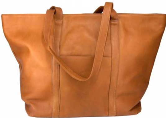
0230 - Suburban Tote (LG)