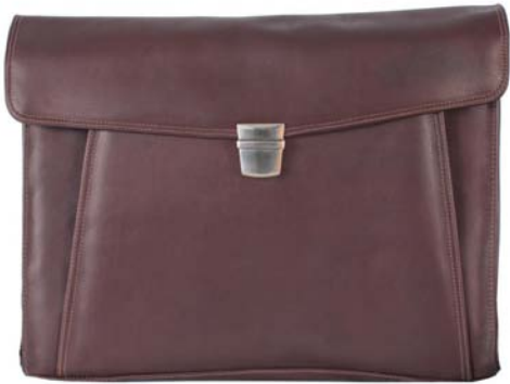
0520 - Executive Portfolio