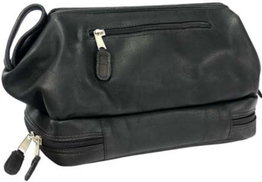
0810 - Uptown Travel Kit