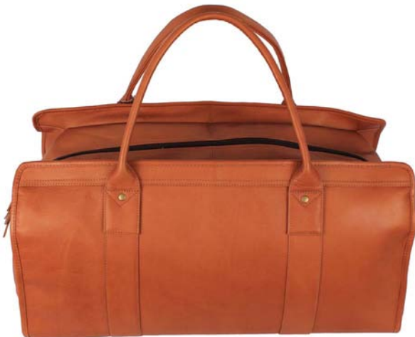
7750 - Washington Weekender

12”h x 8.5”d x 21”l black, natural & cafe