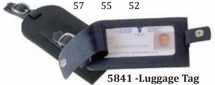
5841 - Luggage Tag