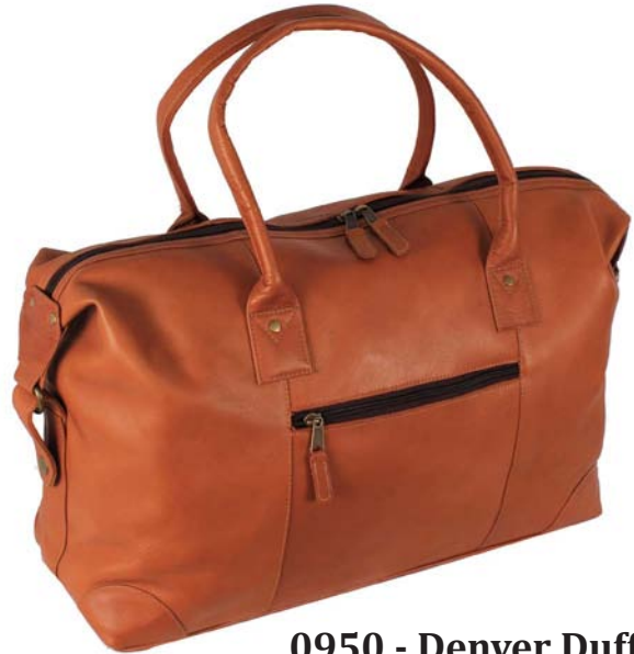
0950 - Denver Duffel 14”h x 7”d x 19”l black, natural, & cafe 10 100 500+ 3C 190 182 174