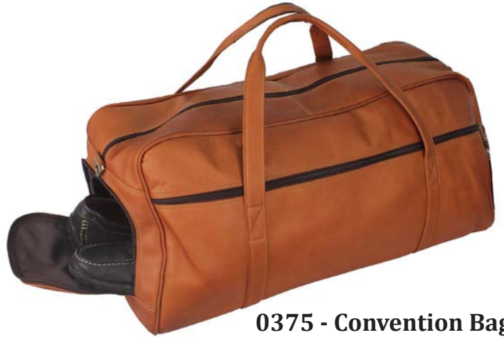
0375 - Convention Bag

10.5”h x 10”d x 22”l black, natural, & cafe 10 100 500+ 3C 234 224 214