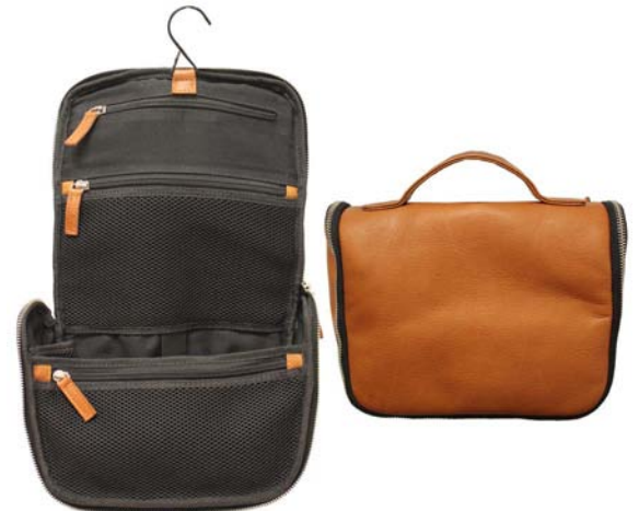
0815 - Hanging Travel Kit