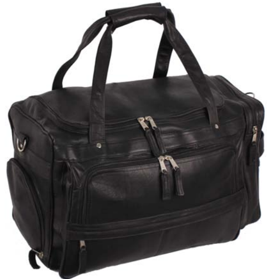
0345 - Berkeley Bag

12”h x 9”d x 21”l black, natural, & cafe 10 100 500+ 3C 182 174 166