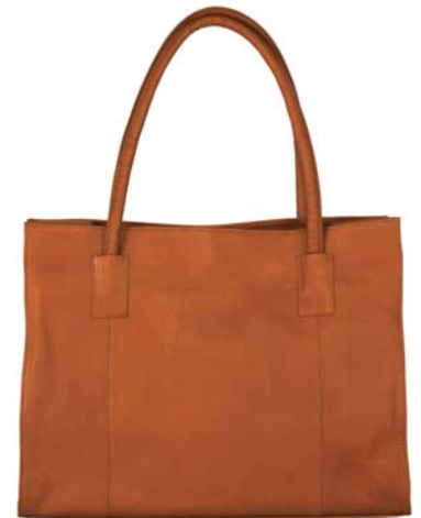
0240 Festival Tote