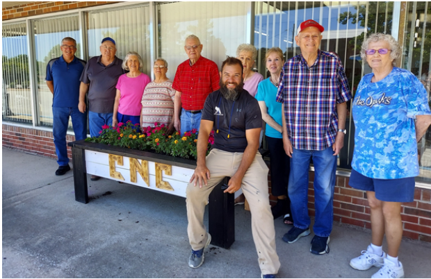
California Nutrition Center