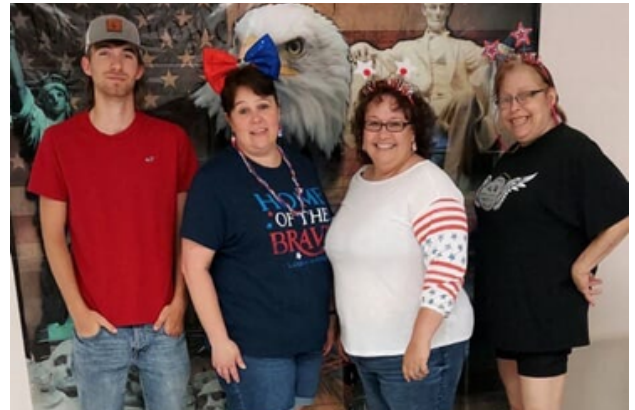
Salem Nutrition Center