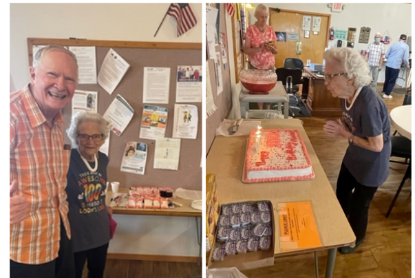
Eldon Senior Center