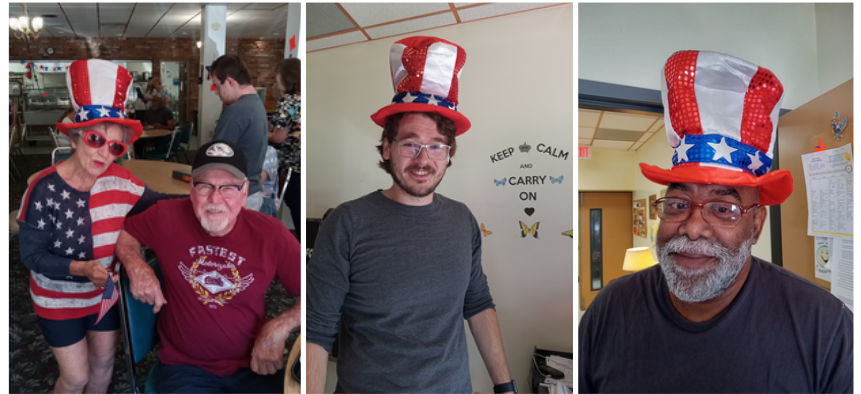
Cole County Nutrition Center