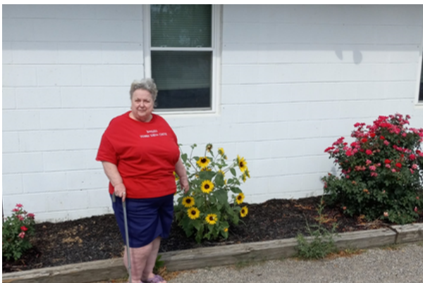
Vienna Senior Center