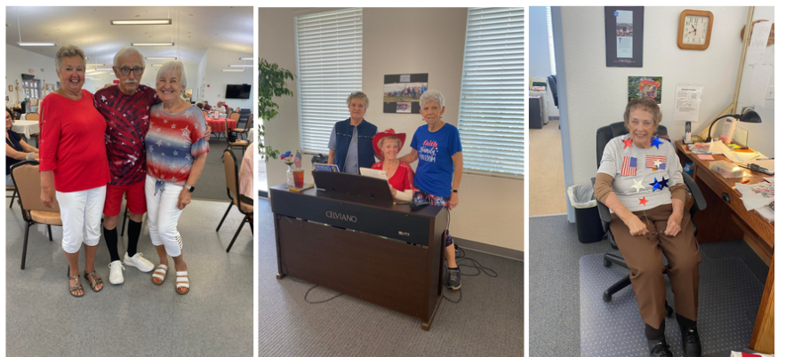
Osage Beach Senior Center