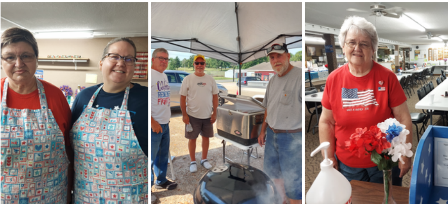
Tipton Nutrition Center