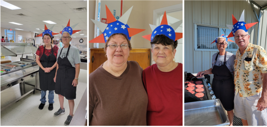
Camden Nutrition Center